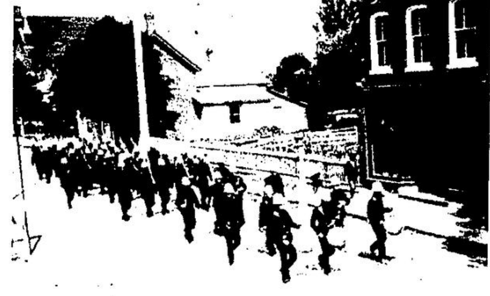
MILITIA RETURNING from camp were photographed as they passed the present Elissa Shoe store in July, 1898. The Y.M.C.A. was built in the vacant lot. The house at the corner belonged to the Perrymans. It's presently occupied by Hurst's barber shop, Blue Springs flower shop and the Mainprize family.

Cavic took over the location and opened as Acton Shoe Repair. The building was recently changed to accommodate Elissa Shoes.