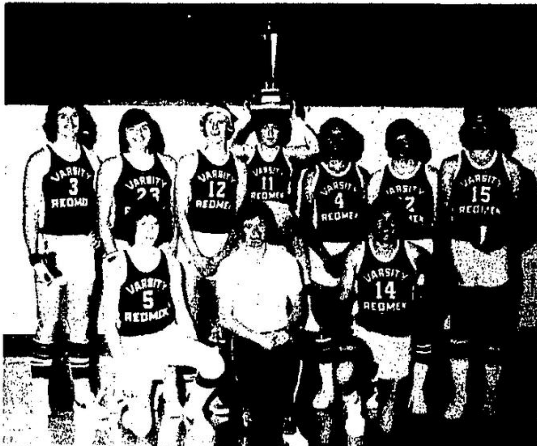
ACTON REDMEN LOOK FORWARD to a successful weekend when the All-Ontario "A" division basketball championships are hosted at the high school. They enter the tourney hot on the heels of a championship trophy award at the Walkerton tourney two weeks ago.

A letter has been distributed throughout the school with information concerning responsibilities of billetes.