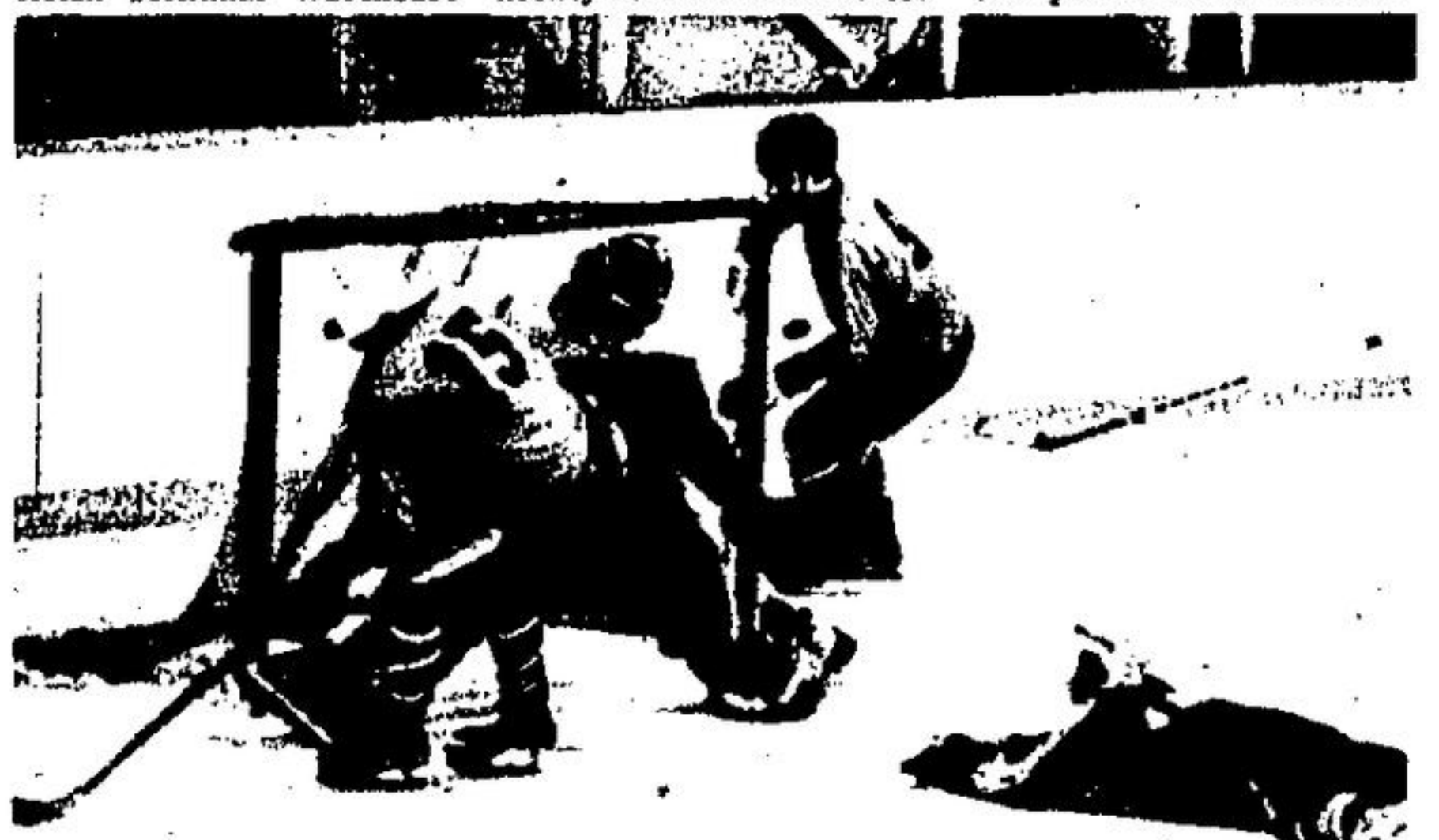
THIS HAPPENED TOO often to the Acton Tigers Monday as they lost 9-2 to a tough Cedar Valley team in WHD playoff action. Tigers had only one man on the bench, and could not keep up with the visitors. Tigers made it to the playoffs with a 5-4 win over Hawaiian Tropics which gave them second place over all in the Wellington-Halton-Dufferin standings.

Final standings were adjusted at a league meeting on the weekend since at least four teams, Acton, Milton, Grand Valley and Orangeville Pirie had used illegal players on occasion.