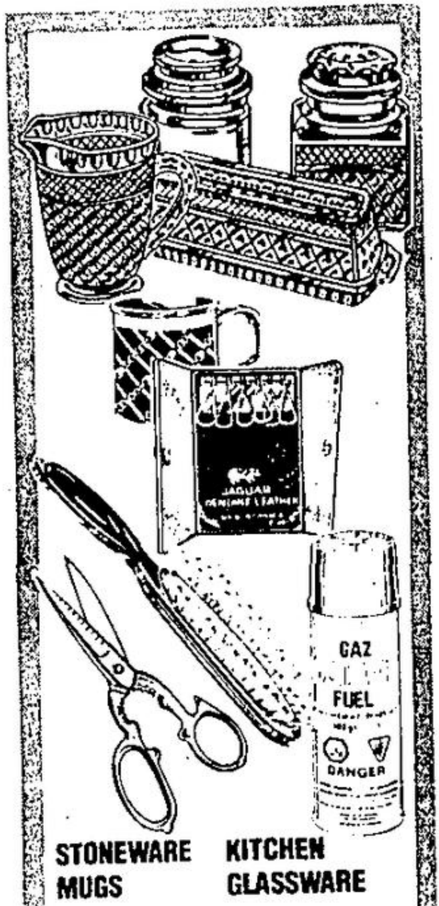
STONEWARE MUGS KITCHEN GLASSWARE

ON SALE: MARCH 1ST TO MARCH 4TH WHILE QUANTITIES LAST