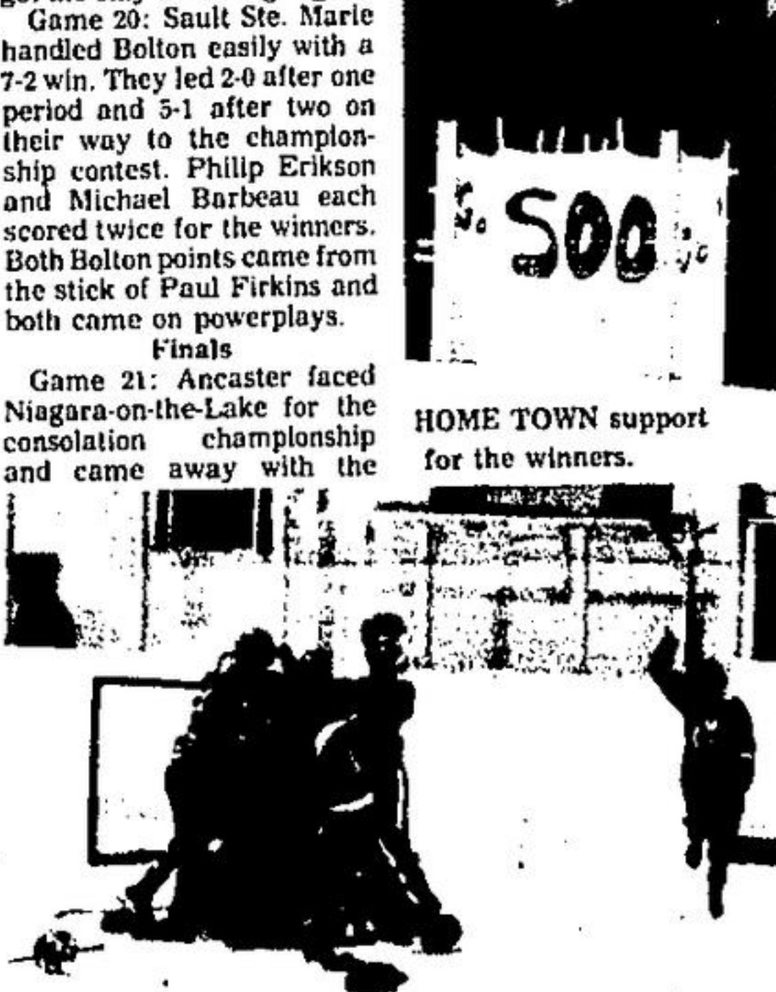
SAULT STE MARIE show their joy at the final buzzer of the championship game. They defeated Preston 3-0 to take the championship trophy again.