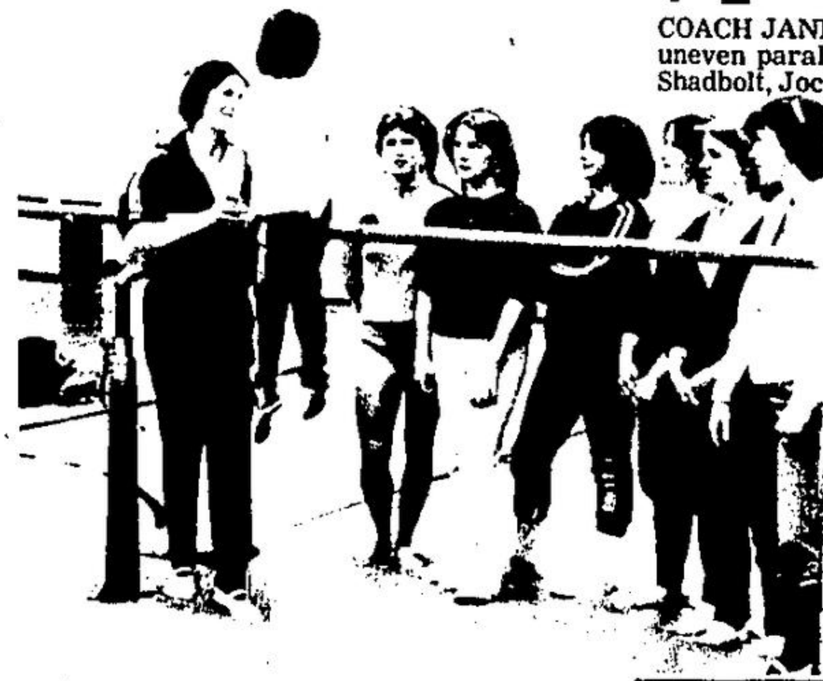
SIX AND SEVEN YEAR OLD gymnasts watch one of their group practise on the balance beam.