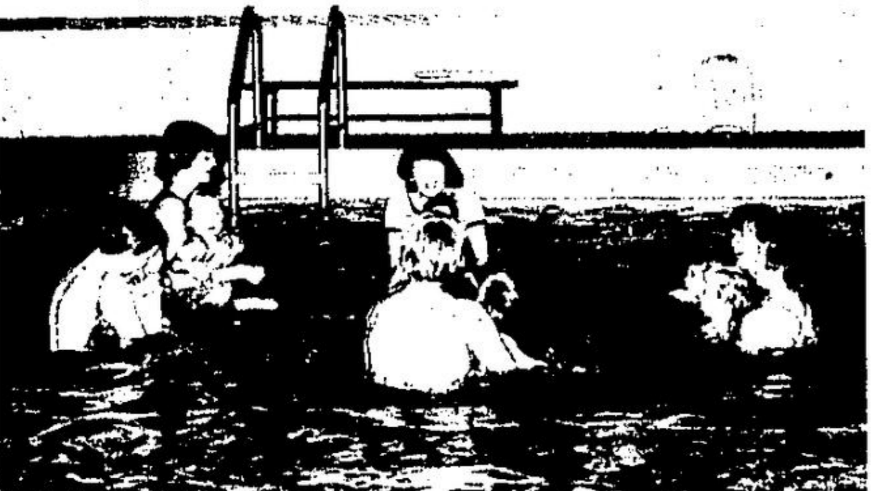
MONDAY MORNING swims are part of the program at Tinker Bell Nursery School. Children, assisted by volunteers, play a game of ring-around-a-rosy. School is looking for additional volunteers.

Operating with little more than half its optimum number of volunteers Tinker Bell Nursery School for the Mentally Handicapped has put out an appeal for additional volunteers.