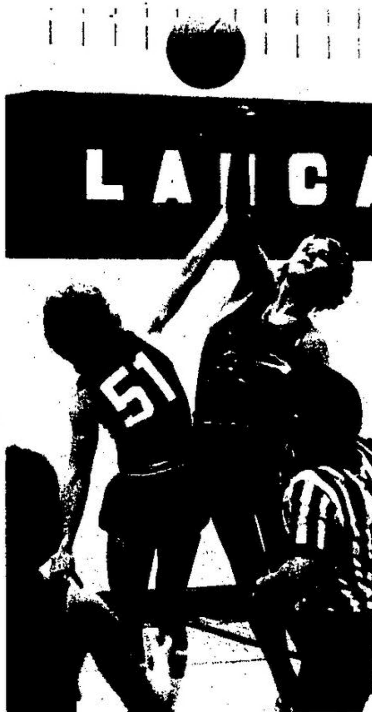
BROOKVILLE JUMPER wins the top at Saturday's tournament. Brookville reached consolation finals before bowing out.

Eight teams took part in the ten game tourney.