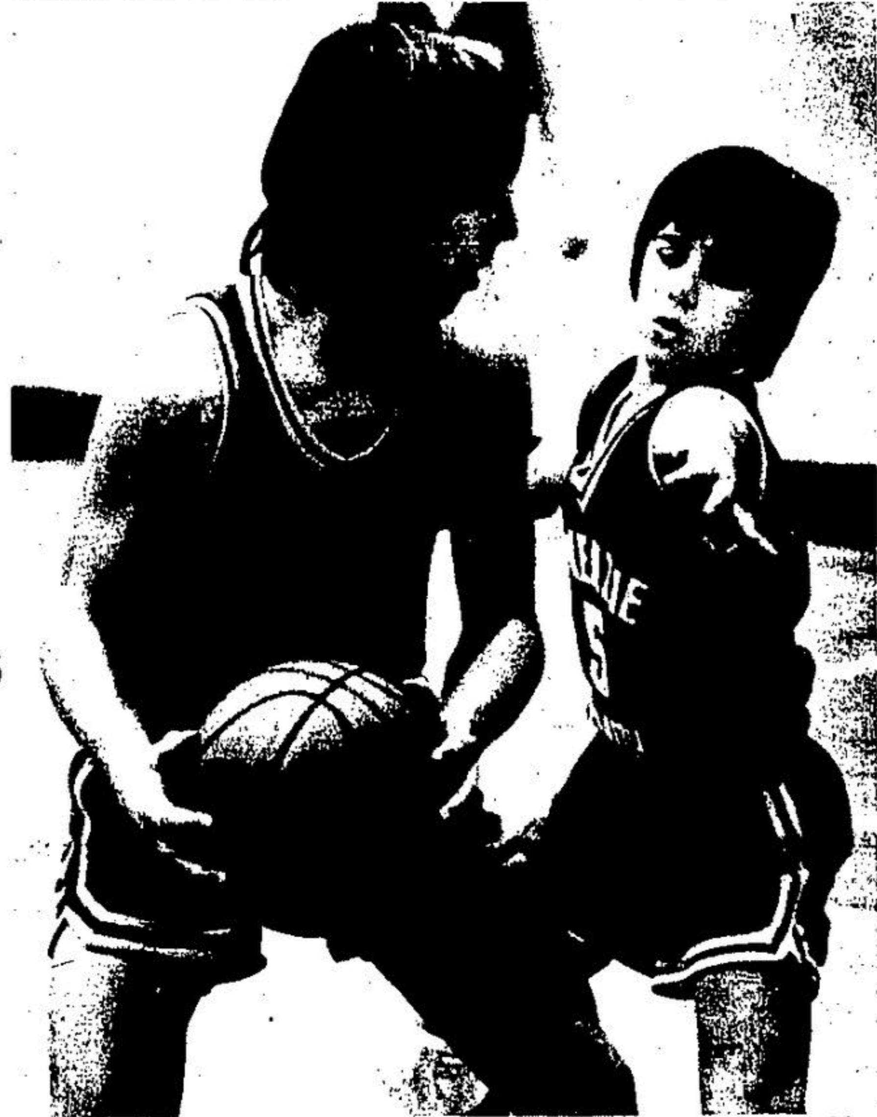
PRESSURE GAME: McKenzie-Smith cager keeps the pressure on his Stewarttown opponent during their second period matchup at Red and White Invitational. Superior height gave Stewarttown the win, and they went on to take the championship trophy for the day.

Senior team Another possibility for former Rams would be to play for the senior team in town. If it operates again this year, Nothing was brought up at the Ontario Lacrosse Association meeting in November about entering the team in intermediate play, but they will likely do what they did last year, and arrange exhibition games. The only difference would be they are starting earlier, and would be able to get many more games in.