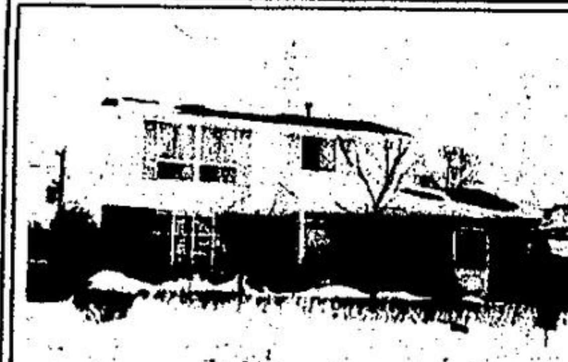
FAMILY SIZED loaded with many extras and located close to scenic Fairy Lake in Acton. This 4 bedroom 2 storey home also includes 2 baths, ground floor family room with fireplace and patio doors, eat-in custom kitchen, separate dining room, fitted broadloom, rec room and a 20' x 40' inground pool. Priced to sell at only $66,500.