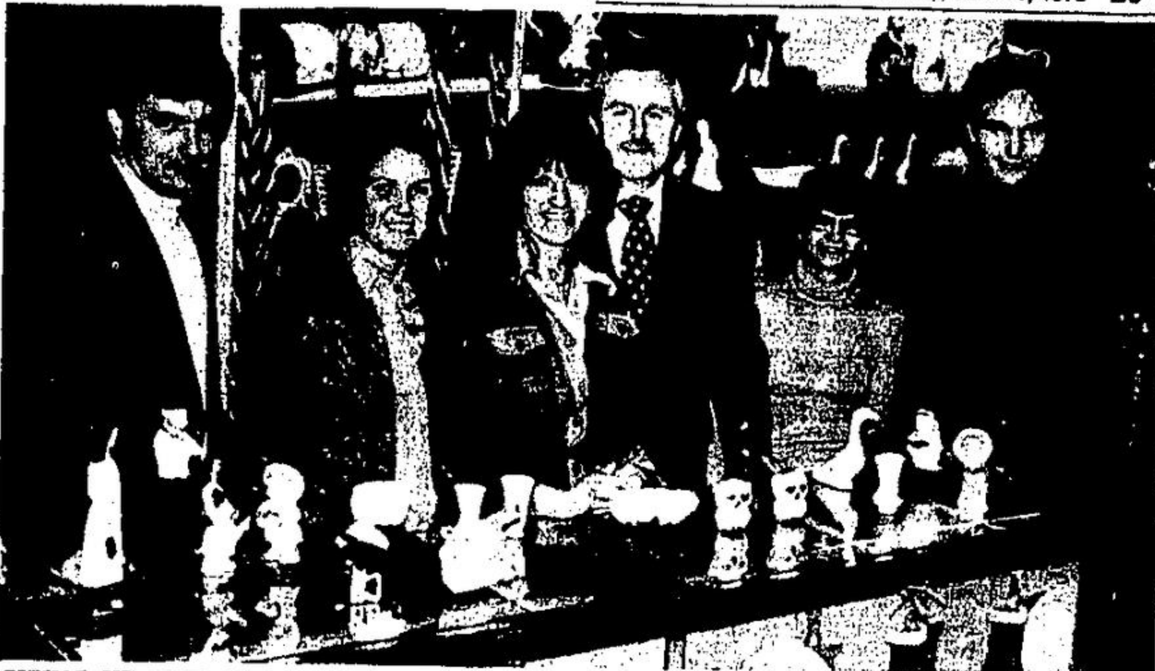
SIZING UP THE CERAMICS made and displayed at ARC Workshop in Hornby are the executive members of the North Halton Association for the Mentally Retarded, who were named to office for 1978 at the group's annual meeting. From left to right are second vice-president