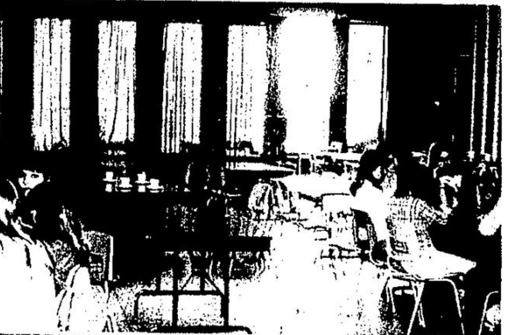
THERE WERE many empty chairs at the high school on Tuesday. School buses weren't running and the special Canada Day program was cancelled.