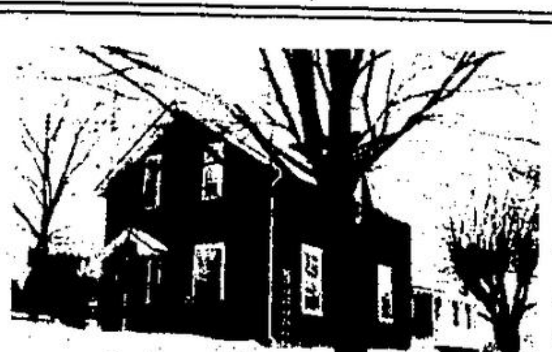
FIRST TIME BUYERS consider this 3 bedroom home located on a quiet street close to downtown. There's new broadloom throughout, a separate dining room, eat-in kitchen and it's set on a large lot with mature trees. Priced at only $43,900. Immediate possession available.