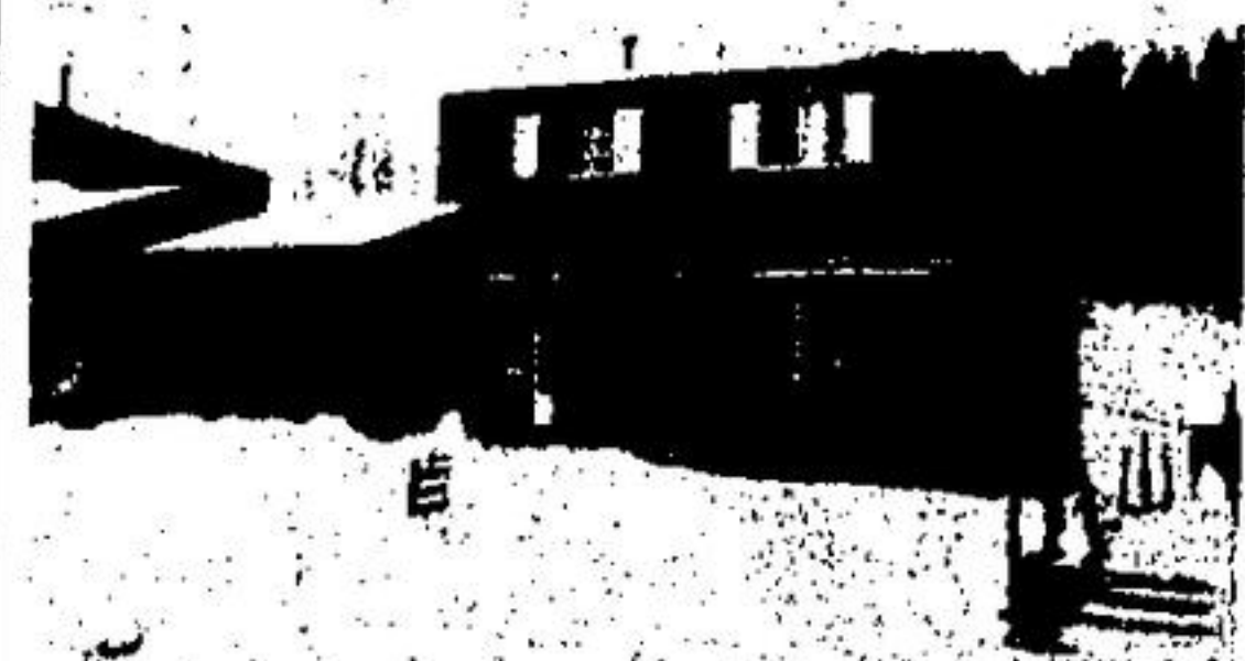
FOR ONLY $55,000 , you'll find it hard to beat this 2 year old 4 bedroom 2 storey home located in a new residential area of Acton. Other features include 2 baths, fitted broadloom, an attached garage and paved drive.