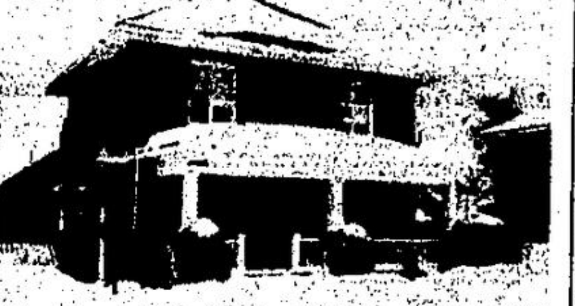
CLASSIC TWO-STORY brick home located on a quiet street close to all amenities. This home is in very good condition and has a lot of character. Features include 4 bedrooms, a spacious living and dining room combination, eat-in kitchen, large entrance hall, front and rear porches and garage. Priced at $49,900.