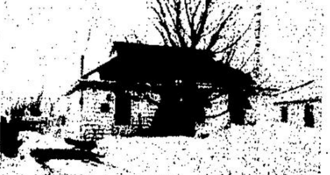
PRIME LOCATION close to schools and shopping. This cozy 3 bedroom home is in immaculate condition and includes maintenance free aluminum siding, broadloom, 4-pc. bath, full high basement, sun deck, large fenced yard and paved drive. Asking $40,500. An ideal home for retirement or newly weds.