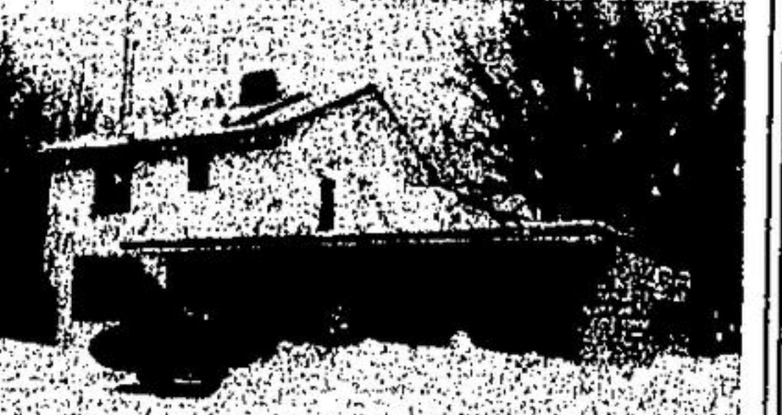
PEACE AND QUIET will be yours if you consider this roomy 2 storey set on a large private lot and surrounded by mature shade trees. Features include maintenance free exterior siding, 3 bedrooms, 2 new bathrooms, broadloom, eat-in kitchen, playroom, double garage and paved drive. Asking $50,900 with low down payment to qualified buyers.