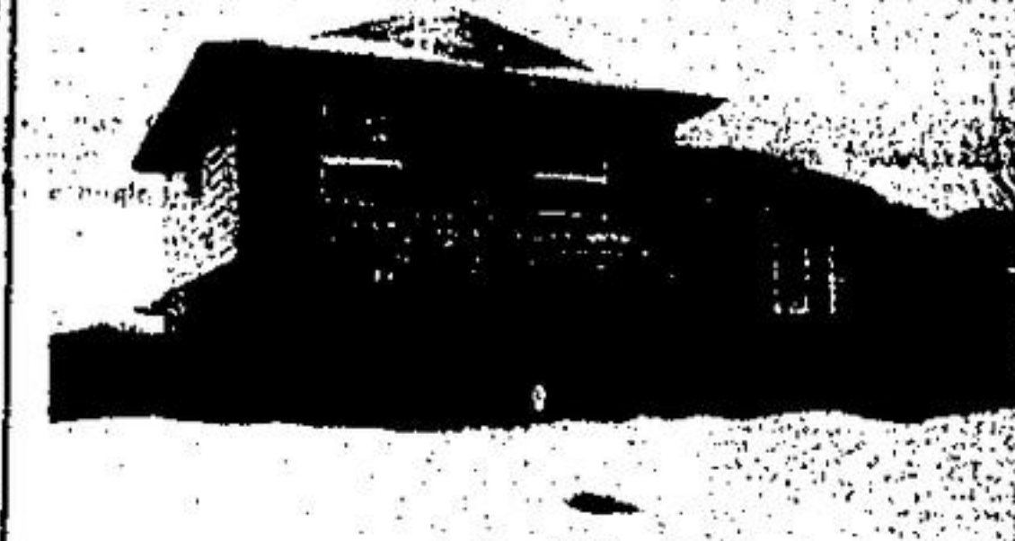
NEED MORE ROOM then check on this spacious 4 bedroom tri-level, on a large private lot with view to Fairy Lake. Features include 2 baths, large living and dining area, eat-in kitchen, rec room, sparkling hardwood floors and attached garage. Asking only $63,900.