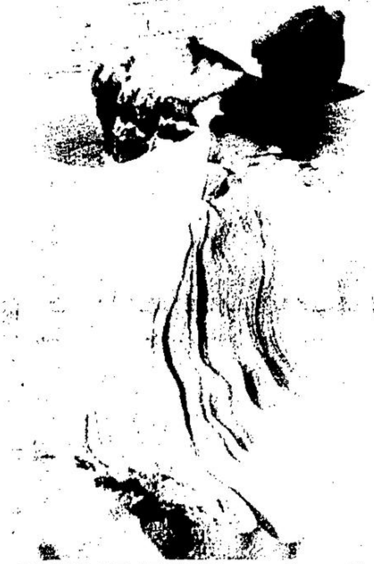
DEEPER AND DEEPER it goes, with no end in sight. In August it will be hard to believe there was this much snow.