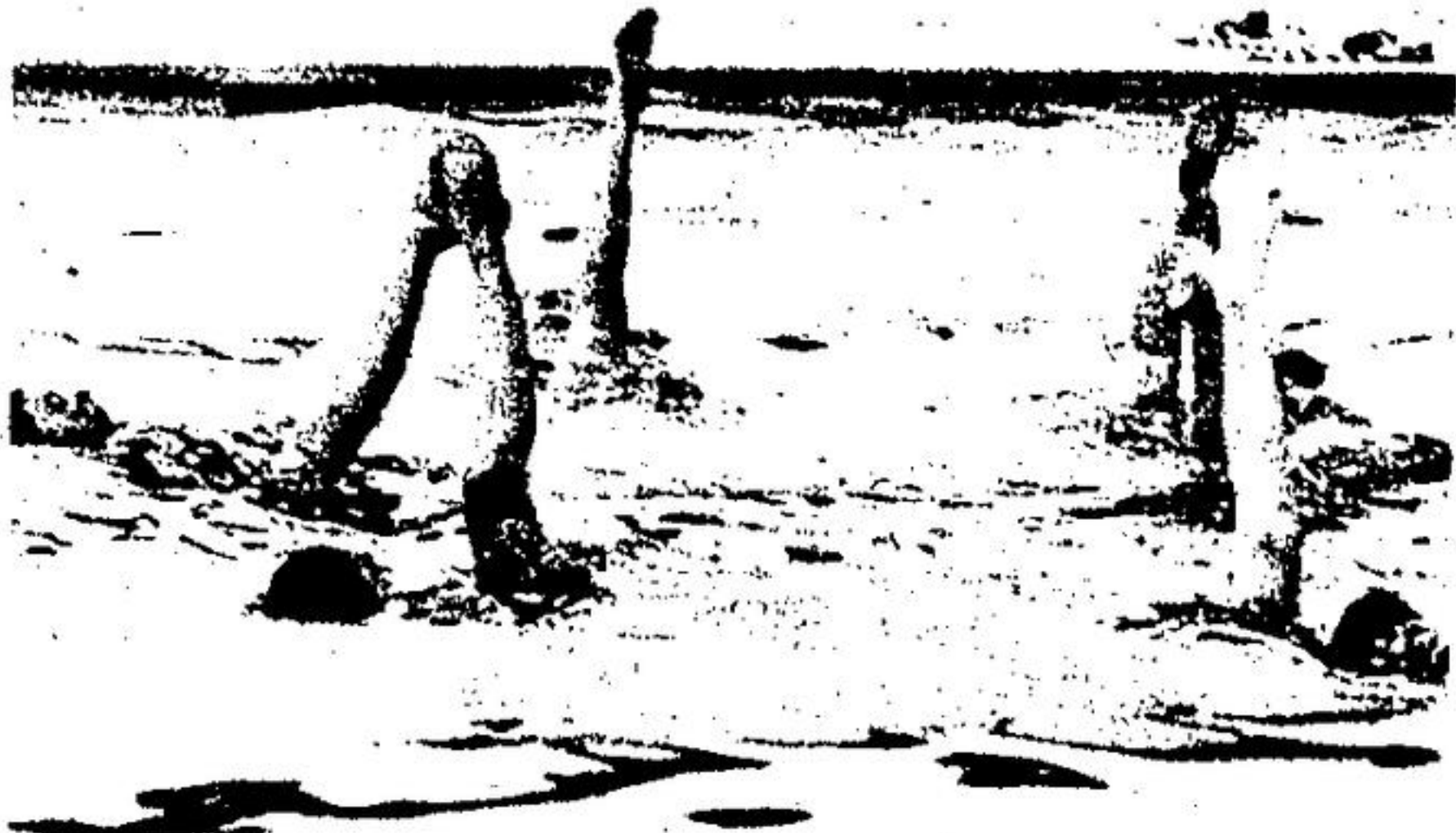
CHRISTMAS LIGHTS skit in the synchronized swimming Water Show in the pool Sunday allowed swimmers to show their swimming and timing talents. Various props, such as flashlights for the above show, were used.