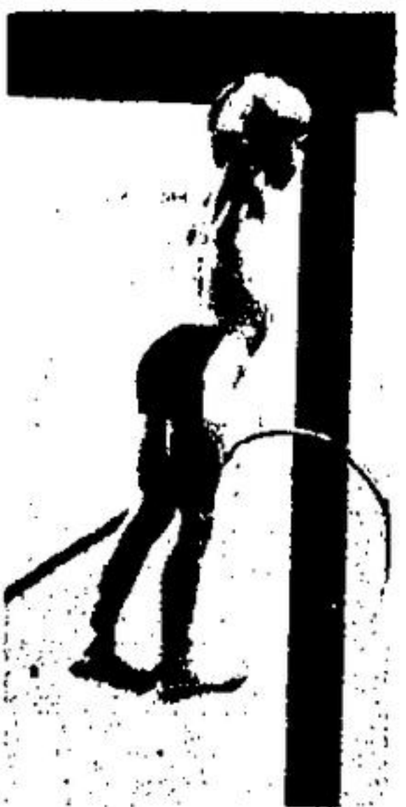
YOUNG diver shows off.

MINUTE MUFFLERS LIFETIME GUARANTEE 10 - 25 9P SERVICE CENTRE 591 ONTARIO ST. MILTON 878 2952