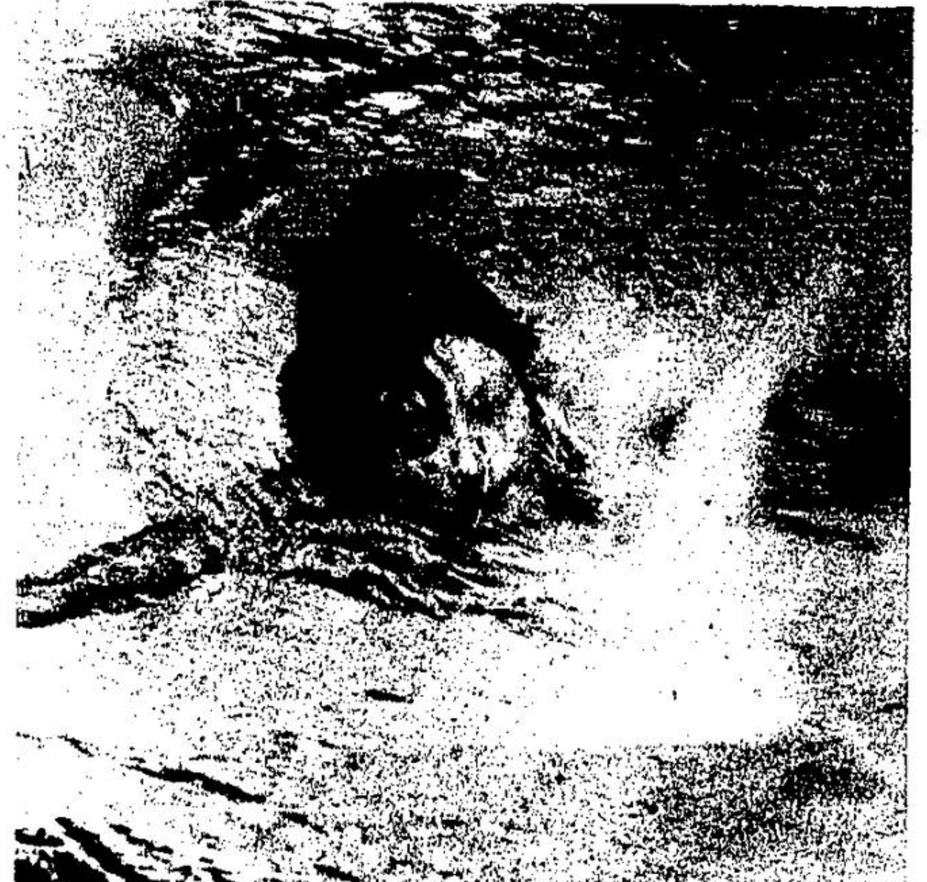
LAURA BRILLINGER was part of a group giving a synchronized swimming show Sunday evening at the pool's Water Show. Music is used for groups to keep perfect timing in order to give an aquatic show.