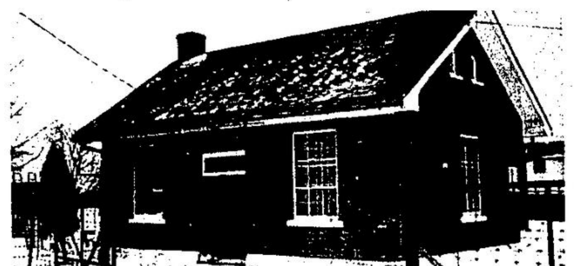
FATE OF THE OLD PUMPHOUSE was discussed last Wednesday at an open meeting. Nearby residents seem to prefer a store on the site.