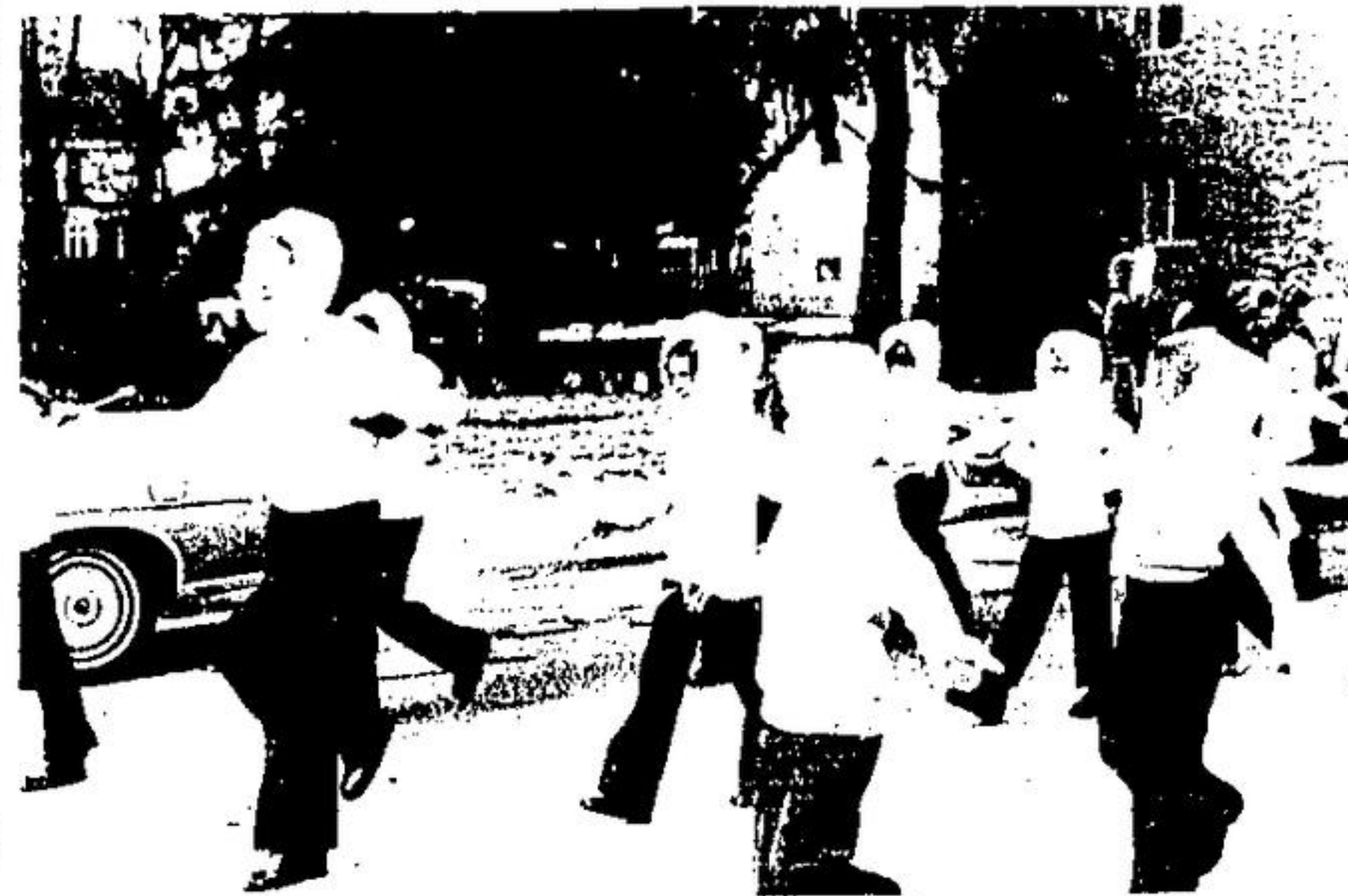
TRAVELLING FROM Georgetown are the Georgetown Majorettes who managed to make it along the parade route twirling their batons and doing various tricks.