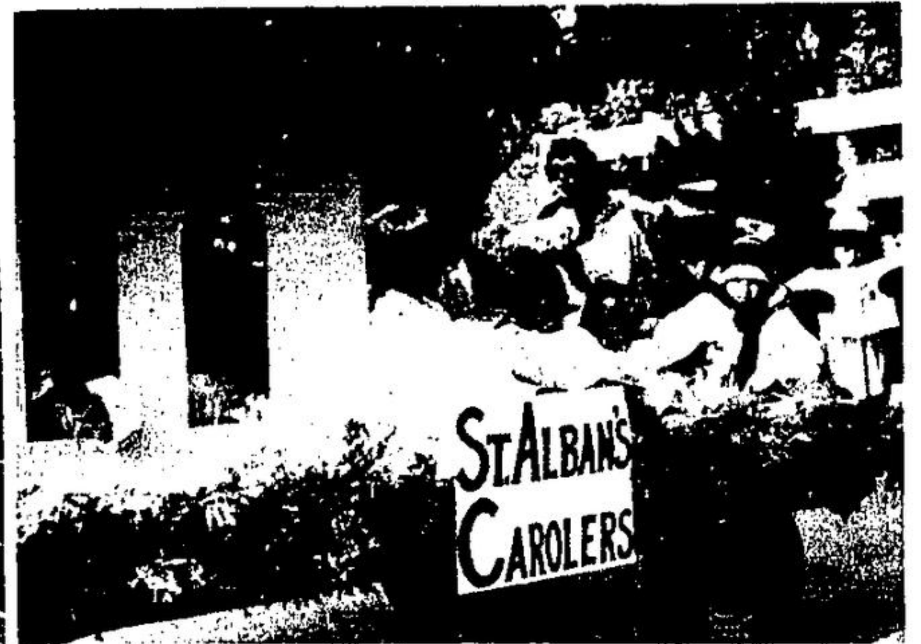
SINGING CAROLS as they rode down the streets, St. Alban's Carolers were a fine addition to the parade.