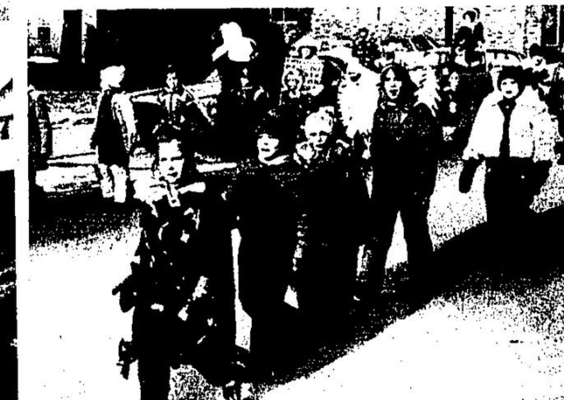
WARMLY DRESSED Brownies marched proudly down Mill St., anticipating hot chocolate at the end of the route.