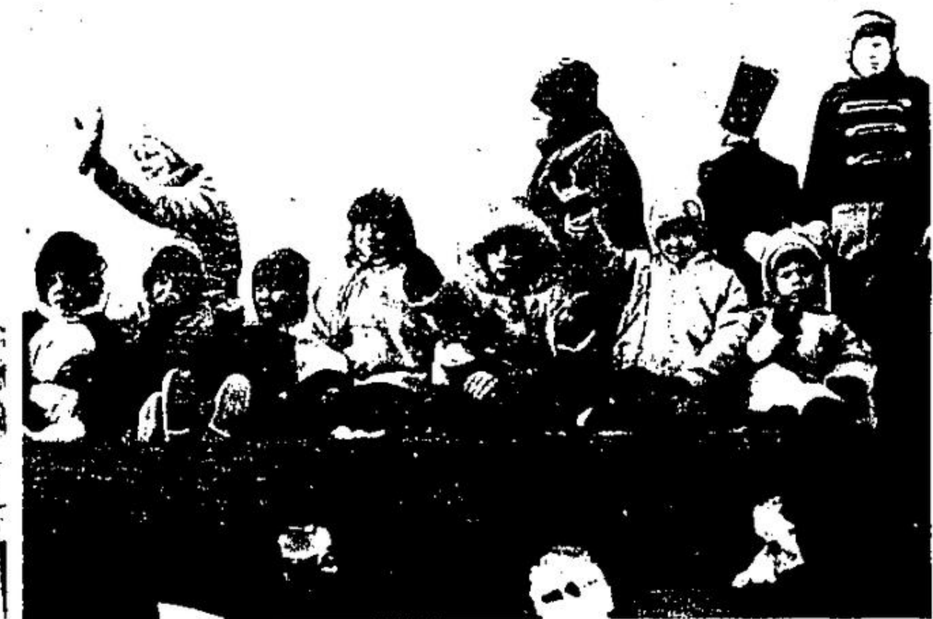
JUDGING BY THE sad looks on their faces, it seems some of the members on the Acton Figure Skating float would rather be at home where it's warm. Cheer up! Christmas is coming.