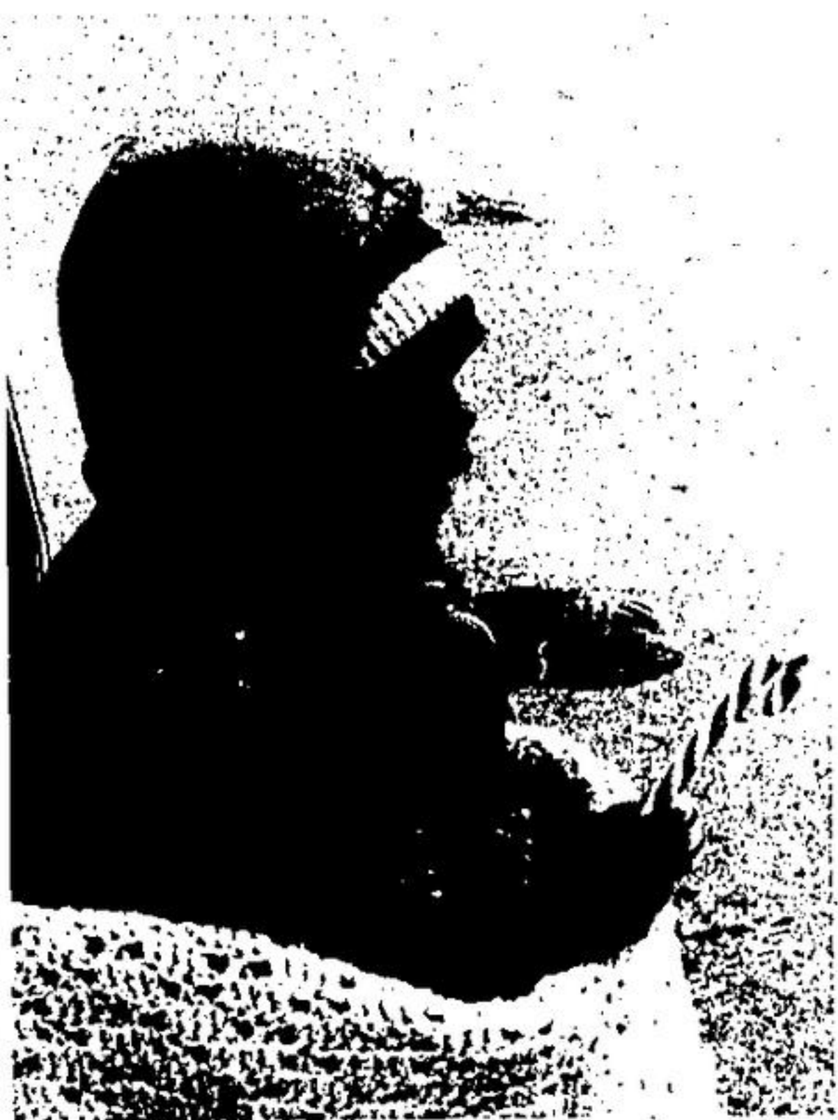
THIS WEE CHILD was dumbfounded when a clown left the flow of the parade and presented him/her with a candy cane. Unfortunately, he/she was too bundled up in clothing for the photographer to determine whether the child was a he or a she.