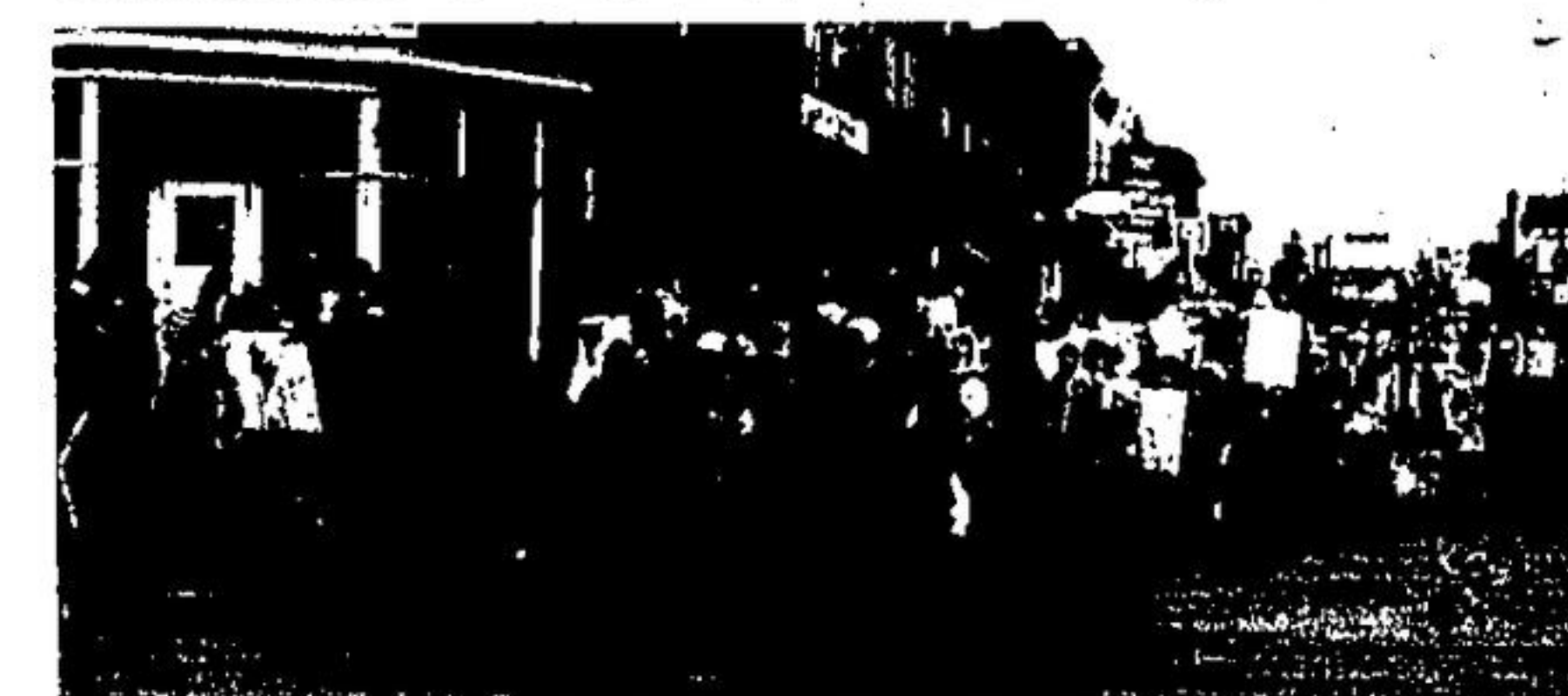
MEMBERS OF the Scouting movement were out in full force Saturday. Some were dressed as robots, others as Christmas gifts.