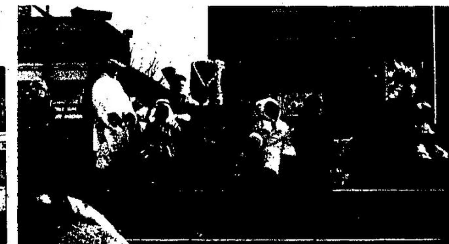
SPEYSIDE SCHOOL CHILDREN sit on bales of hay on their float. Some children wore costumes, including an angel and Christmas present.