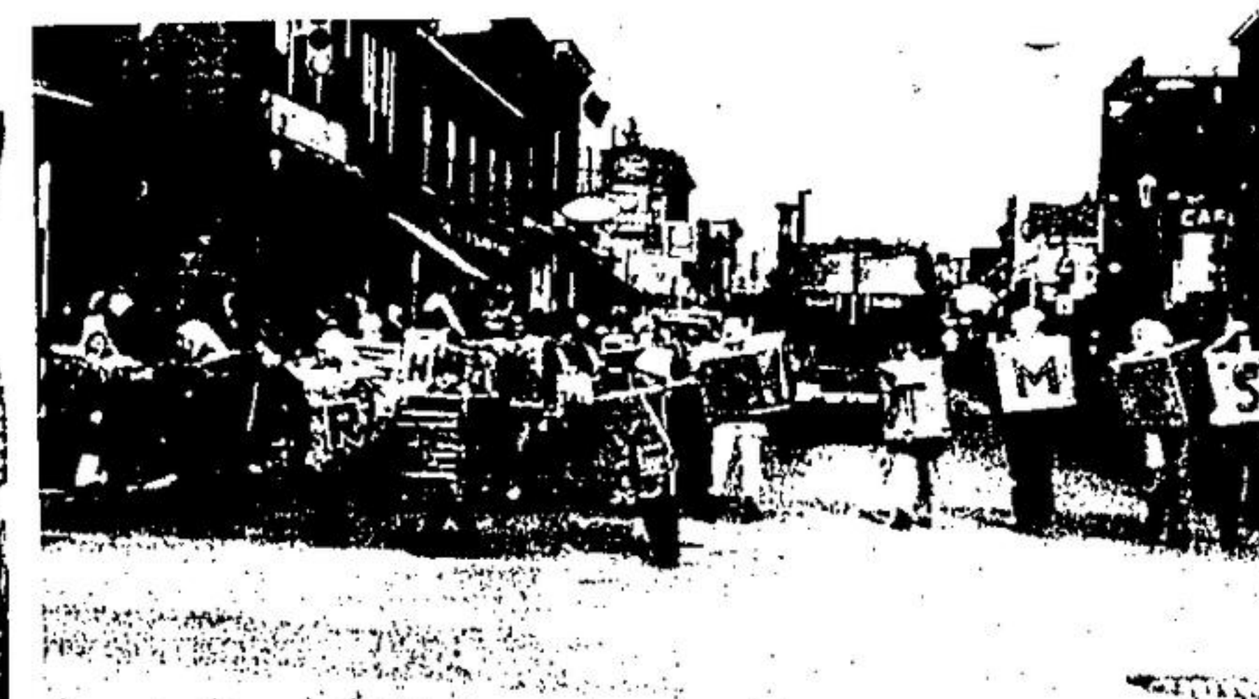
CHAMBER OF Commerce representatives spell out their special message.