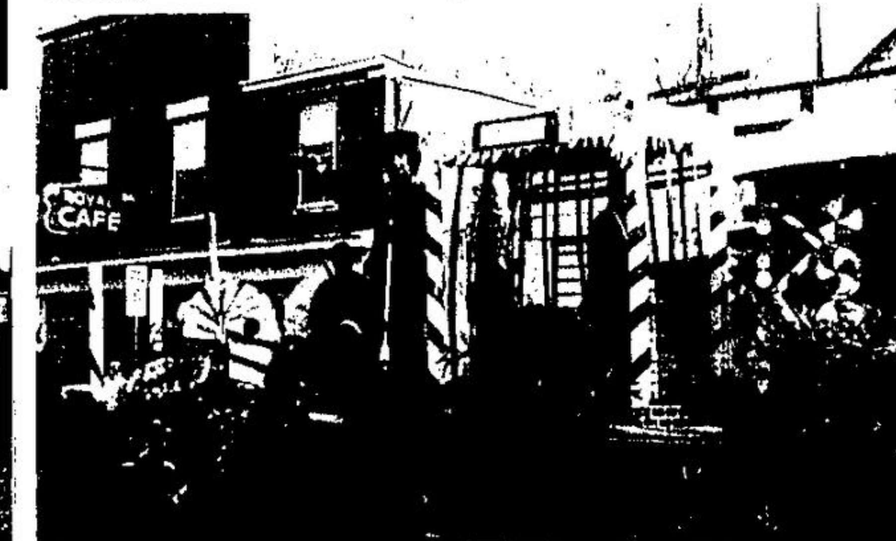
WITCH'S CAGE dominated the Robert Little school float. It was also decorated with a gingerbread house, large candy canes and shrubs.