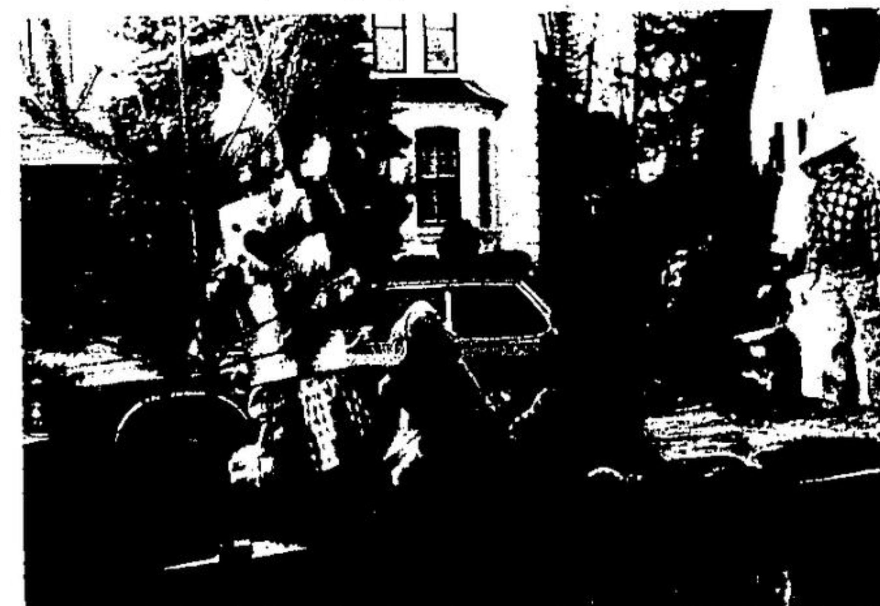
WIZARD OF OZ theme was chosen by the Y's Men for their float. Various characters from the famous movie were on hand for the parade.