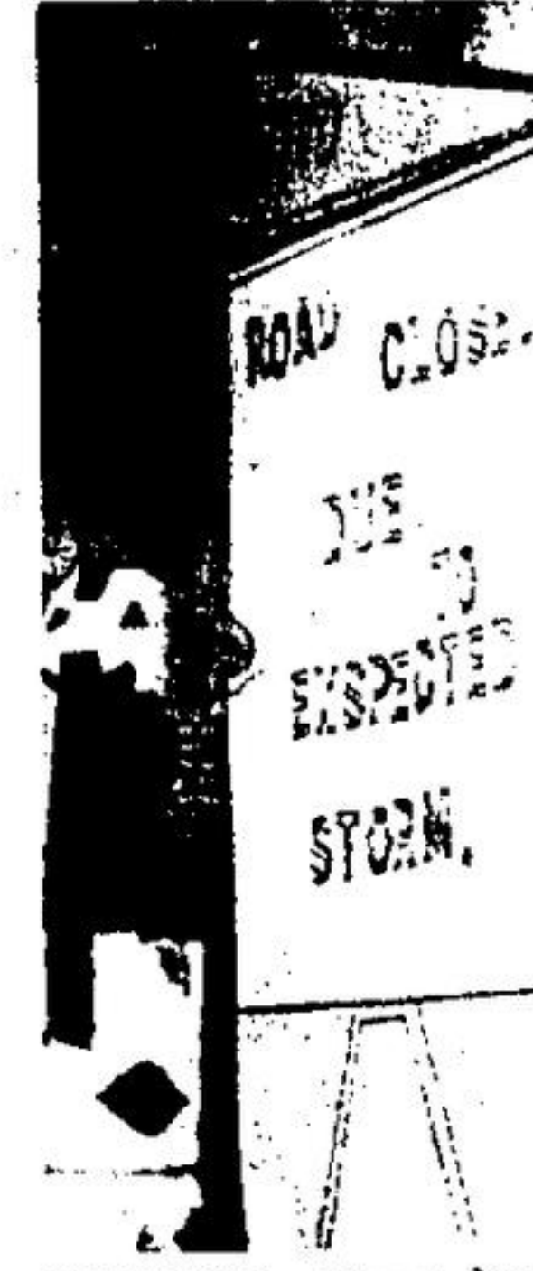
SIGN OF the times, located in Robert Little school foyer showcase. "Expected" must be a new kind of storm.