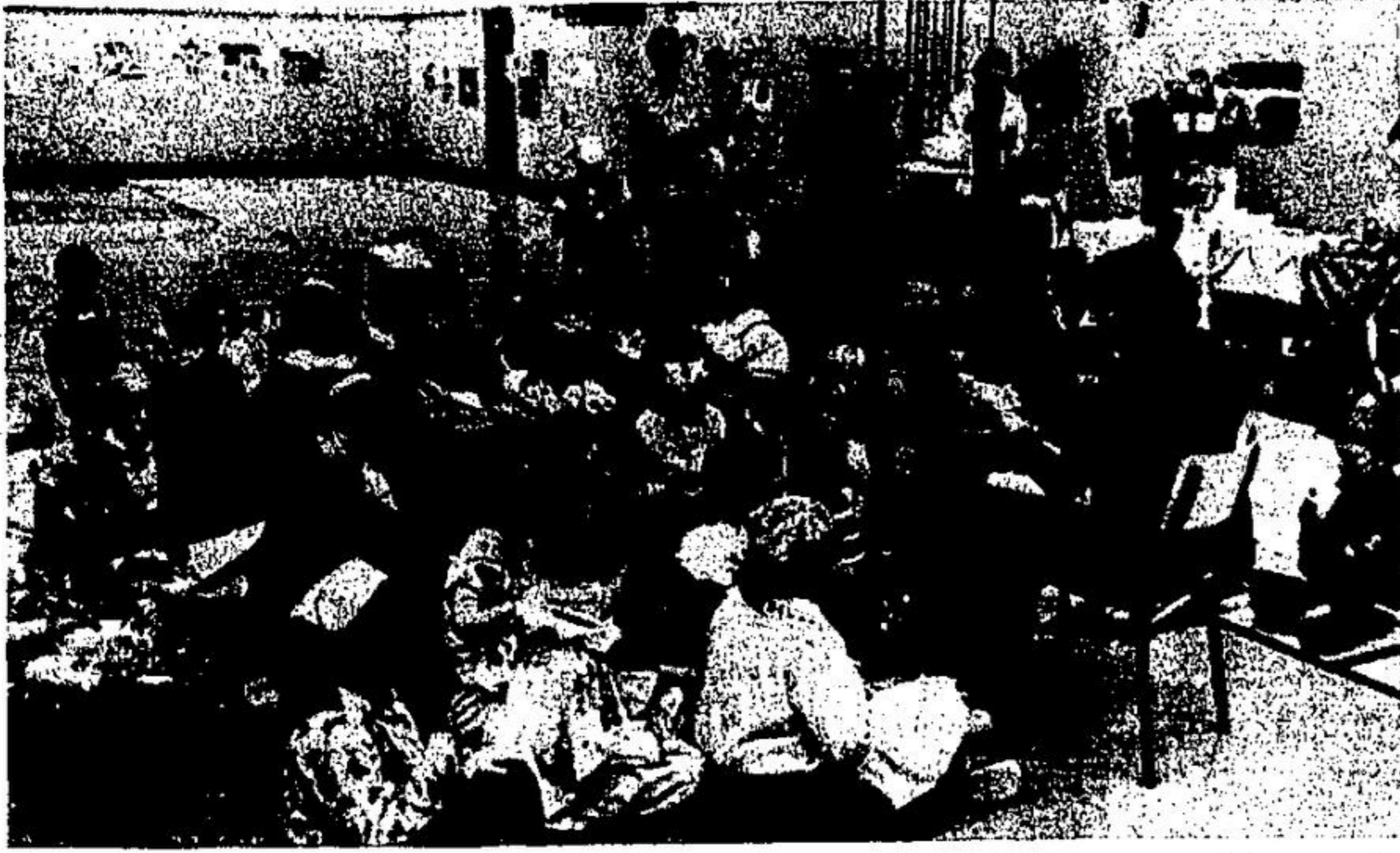
NURSES, GYPSIES, clowns and numerous other costumes could be found at the Speyside Halloween party Monday evening. Over 80 children and 30 parents attended the annual event.