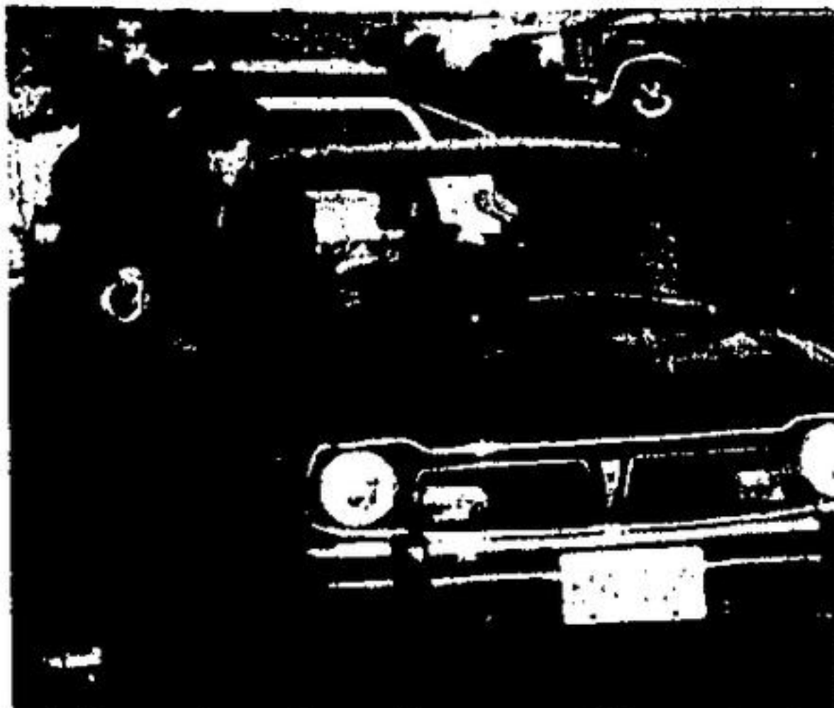
GENTLEMEN, TAKE your marks: Cars line up for the start of the Acton High School car rally Friday. Cars went off at three minute intervals with a set of cryptic directions to be followed.