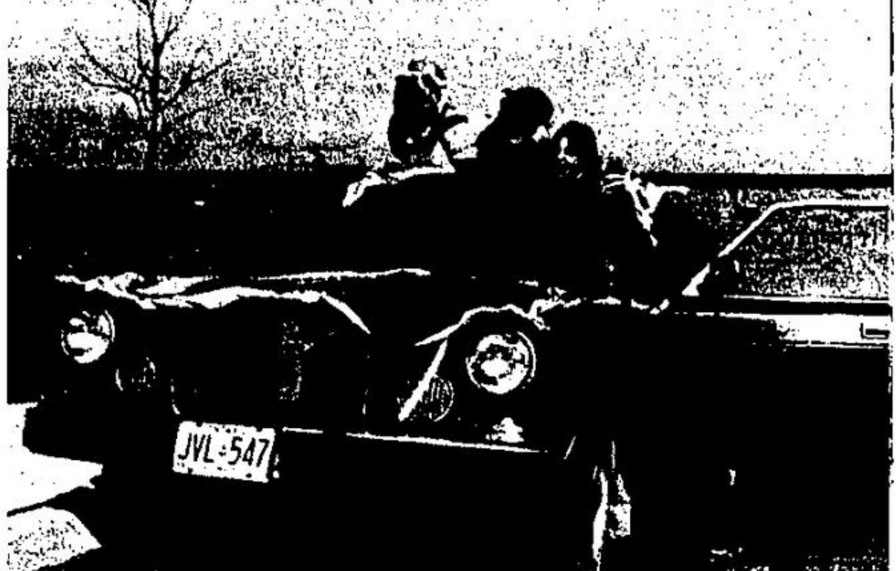
SOME ENTRANTS TOOK THE EVENT more seriously than others, while these girls, the Volvolitas, figured the rally was in reality a fashion show and turned out in their Sunday finest.