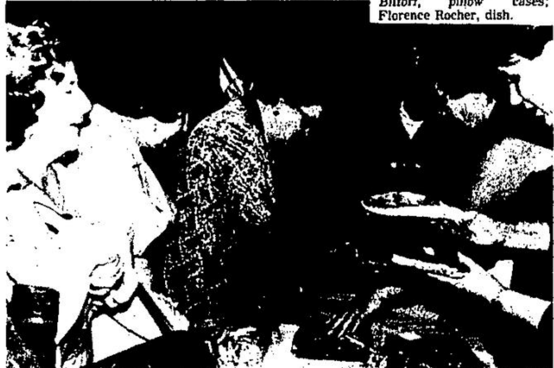
BAKE TABLE was the most popular spot at the Legion Ladies' Auxiliary bazaar Saturday afternoon. Their goods were all sold in about 20 minutes.