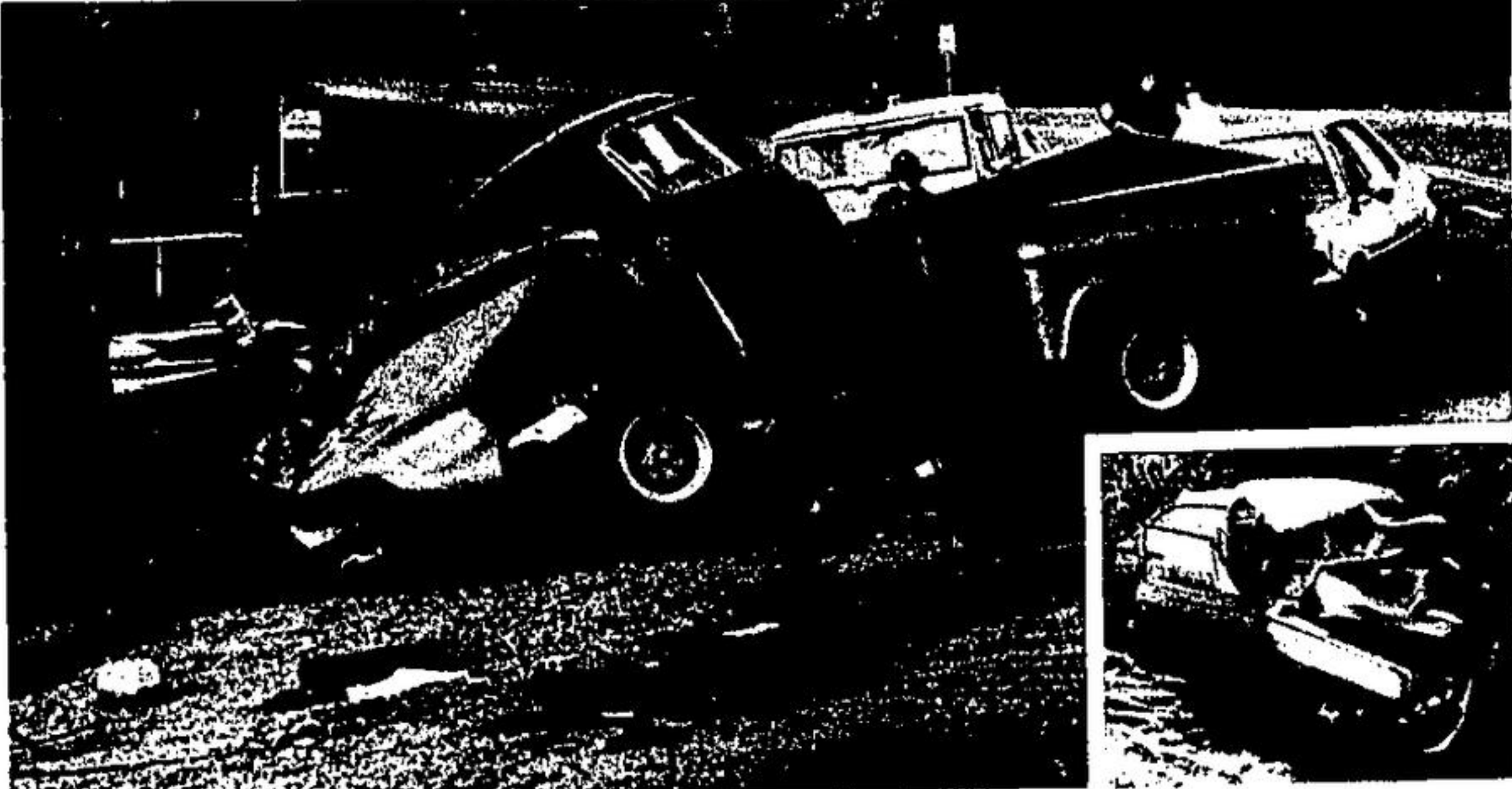
THE DRIVER of the truck is in critical condition following a three vehicle crash Thanksgiving Day on Highway 7 just north of Georgetown.

Georgetown Volunteer Ambulance attended the victims of the crash and Georgetown Volunteer Firemen were on the scene and cut people out of the mangled vehicles. They also remained on the scene in case a fire erupted.