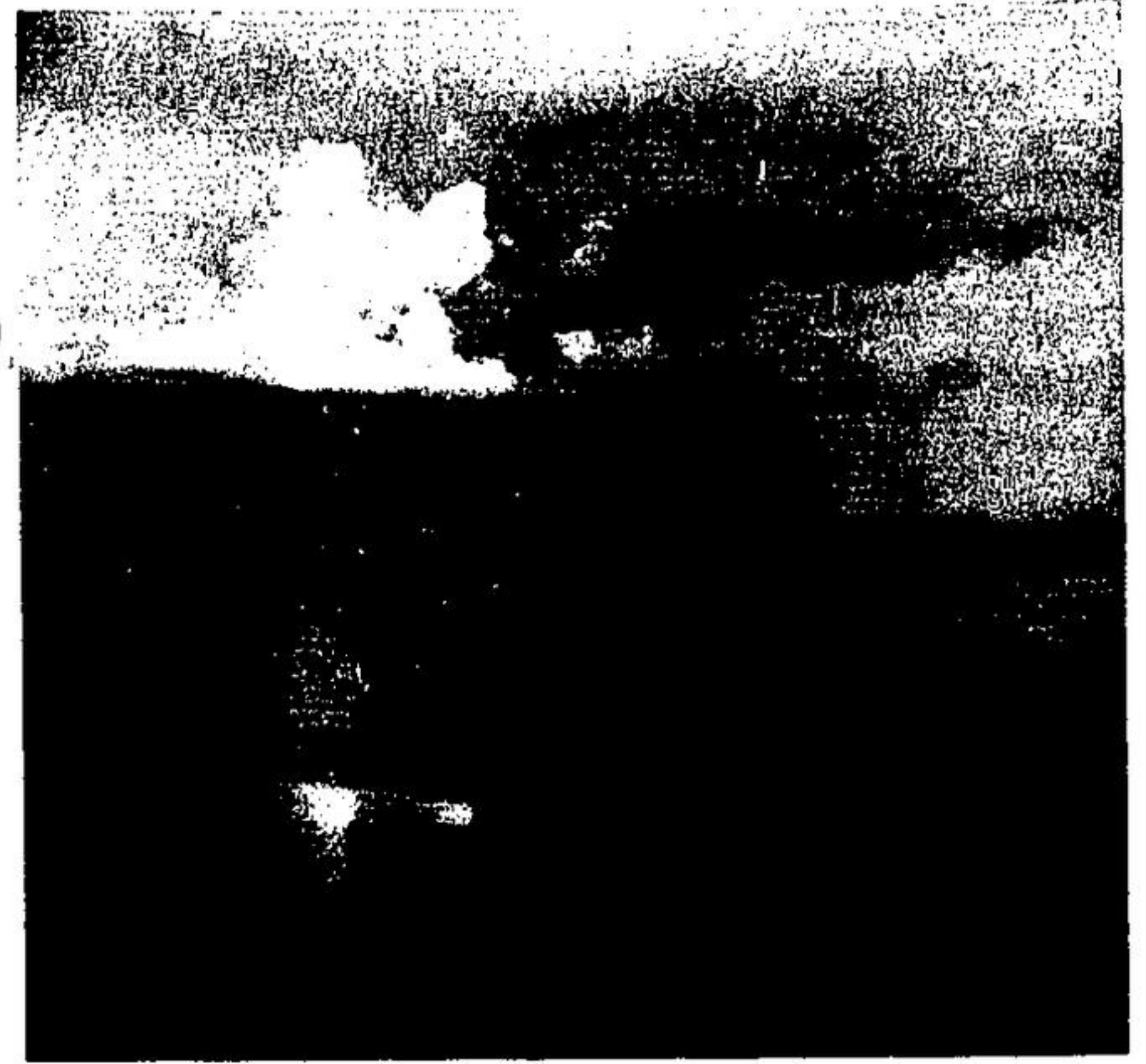
DON HILTS took this effective picture of the new lake created by the Guelph dam.