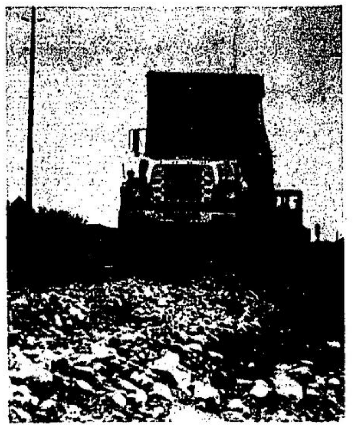
DITCHES ALONG HIGHWAY 7 pose a problem for vehicles driving between Acton and Rockwood, and the larger the vehicle, the bigger the problem.

receive a total of $1,792 for various purchases for their groups. One is the Kinsmen Girls' Softball League, which needs to purchase equipment, and the Credit Valley Artisans to share in the purchase of a kiln, a pottery wheel, table looms and other equipment.