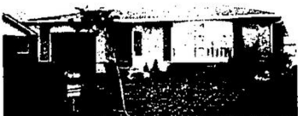
ALL BRICK BUNGALOW $62,900.