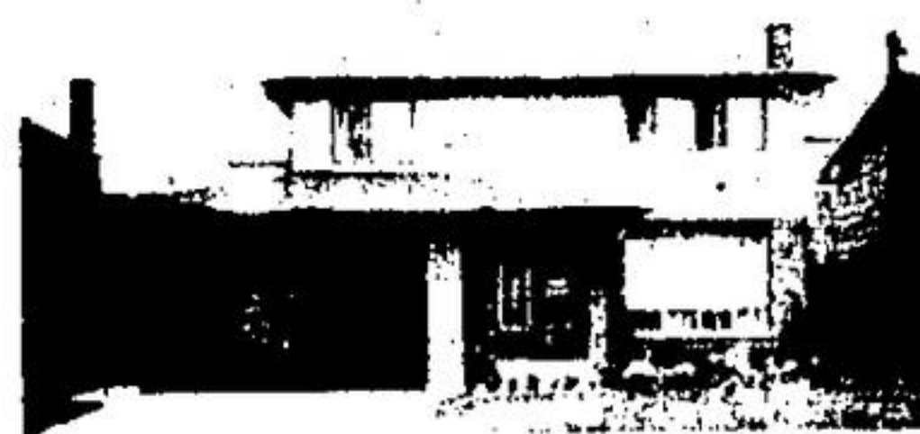
FOR THE YOUNG EXECUTIVE

2 acres land, near Acton, dishwasher, air conditioner and TV tower included.