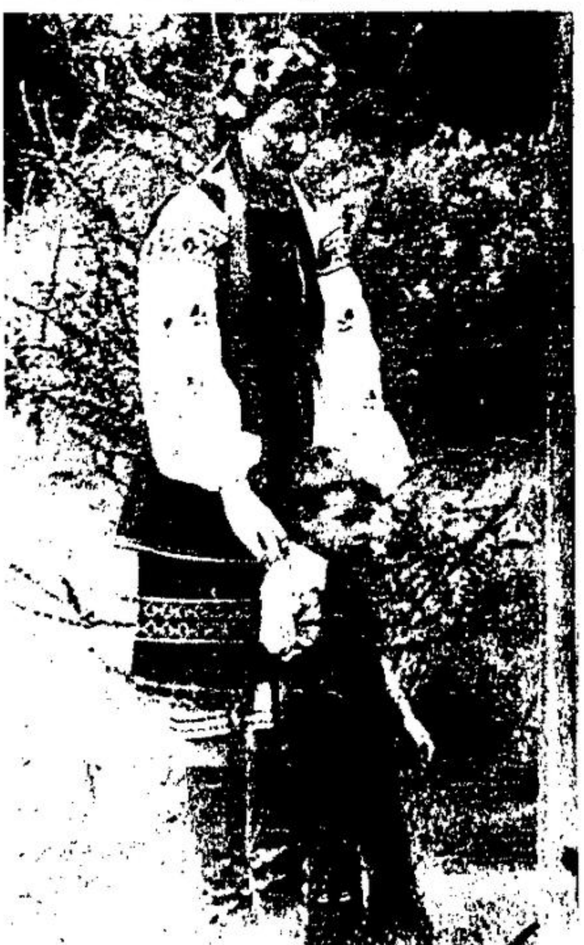
NATIVE UKRAINIAN COSTUME could be seen at the Ukrainian Camp Sunday when 2,000 Canadians of Ukrainian descent gathered for end of camp season festivities.