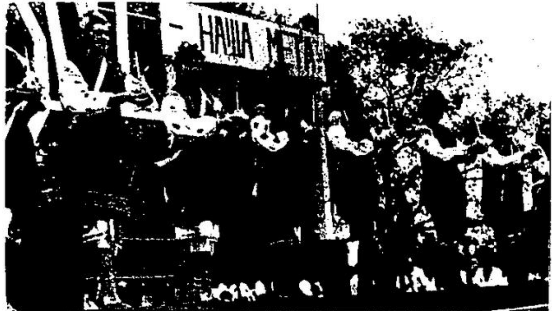
RESPLENDENT IN NATIVE costume, Ukrainian girls dance at the end of camp celebration that took place this weekend at the Ukrainian Camp, situated between Acton and Georgetown.

trousers entertained. A huge bonfire and sing-song ended the festivities. Camp organizers expect an even bigger crowd next year when the camp celebrates its 25th anniversary.