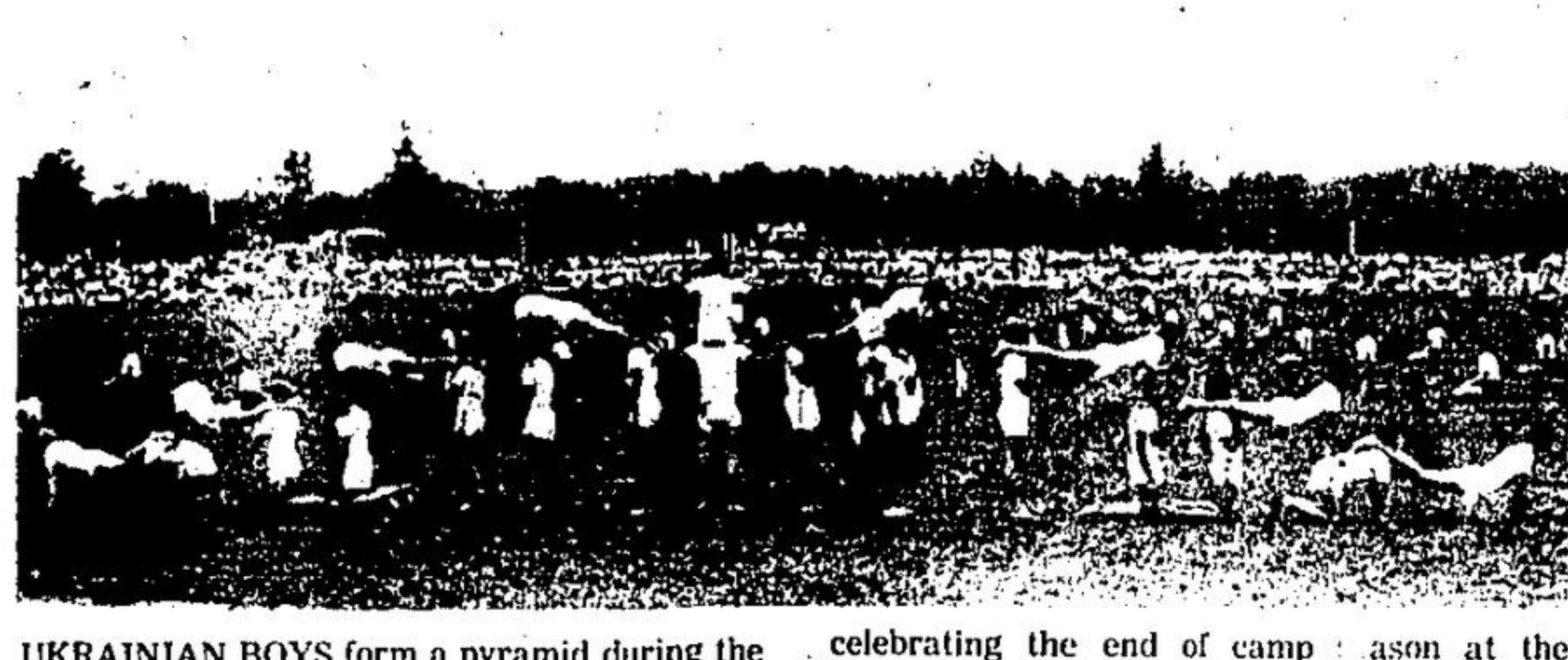
UKRAINIAN BOYS form a pyramid during the gymnastics exercises at Sunday's festivities celebrating the end of camp season at the Ukrainian Camp, Halton Hills.