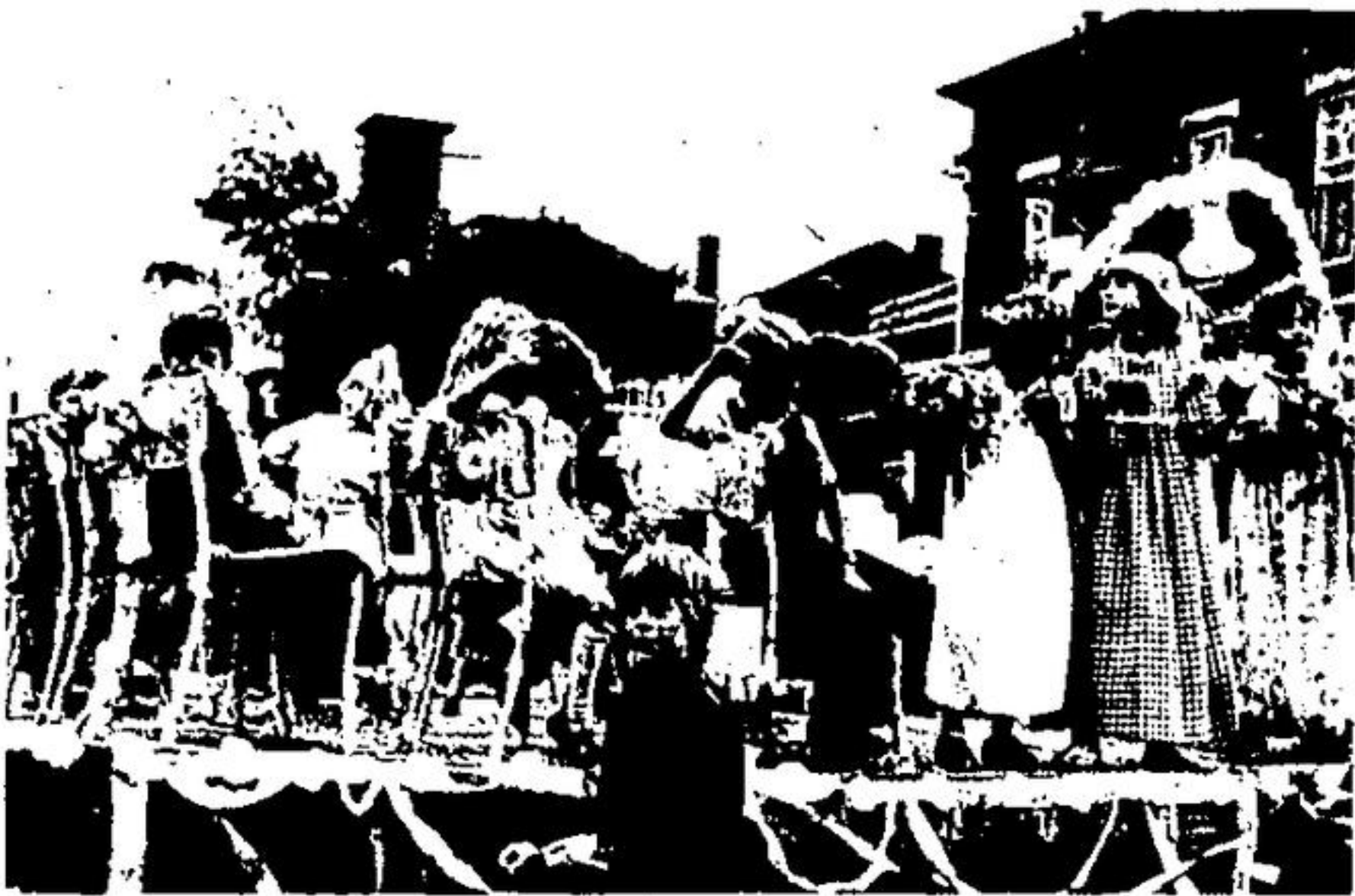
MOCK WEDDING was staged along Mill St. Acton Thursday evening during the summer playground grand finale parade. The Ballinafad playground staged the event complete with bride, groom and attendants.