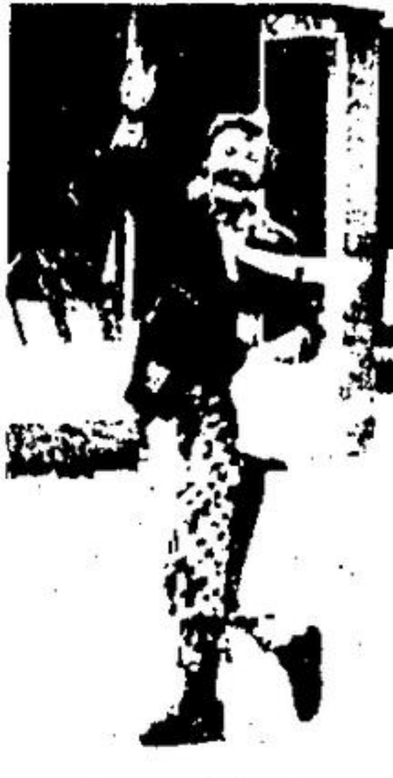
RICH ROCHER a clown? Some people think so. The summer playground supervisor got into the swing of things and tossed candy to children along Thursday's parade route.