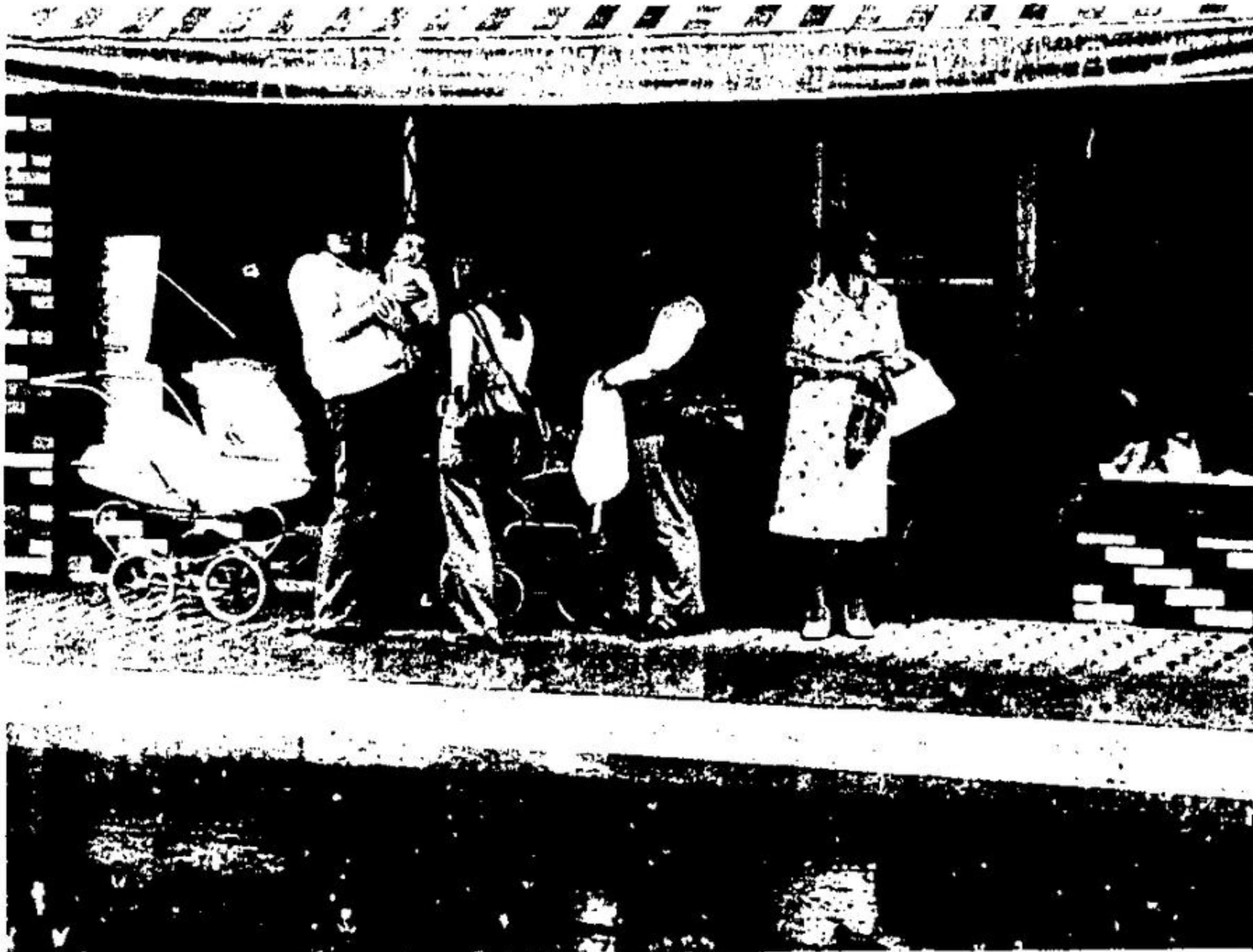
RAIN, RAIN GO AWAY: After only 10 days of August we have already had more than 70 per cent of the rain which normally falls in the whole month. Friday's sudden shower caught these

people without umbrellas so they waited it out under the protecting canopy. More of the wet stuff is expected.