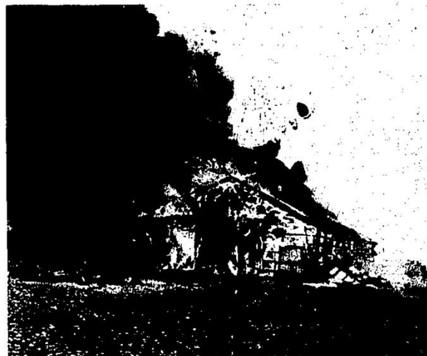
BOOM!!! BOOM!!! Up in smoke and flames goes a storage shed filled with explosives and fireworks owned by Hand Chemical of Milton. Two firemen were injured in the spectacular blaze which lasted approximately one hour and 15 minutes. The explosions and smoke were heard and seen for miles and attracted a huge crowd and reporters and photographers from Toronto, Hamilton and Oakville.