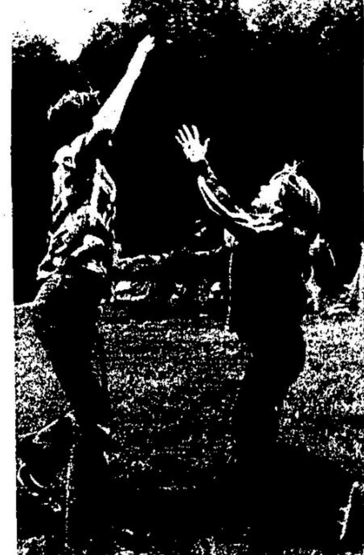
THERE ARE ADVANTAGES to being taller in the "keep away" game played at the Recreation Department Day Camp campout Friday morning. Both these girls were reaching for the playground ball and it's easy to figure out who caught it.

On Saturday, July 9 The Acton Tennis Club held its third successful round-robin mixed doubles tournament. Approximately 30 players participated in this event. A barbecue concluded the afternoon's activities after everyone had enjoyed five matches consisting of four games each. Two draw prizes