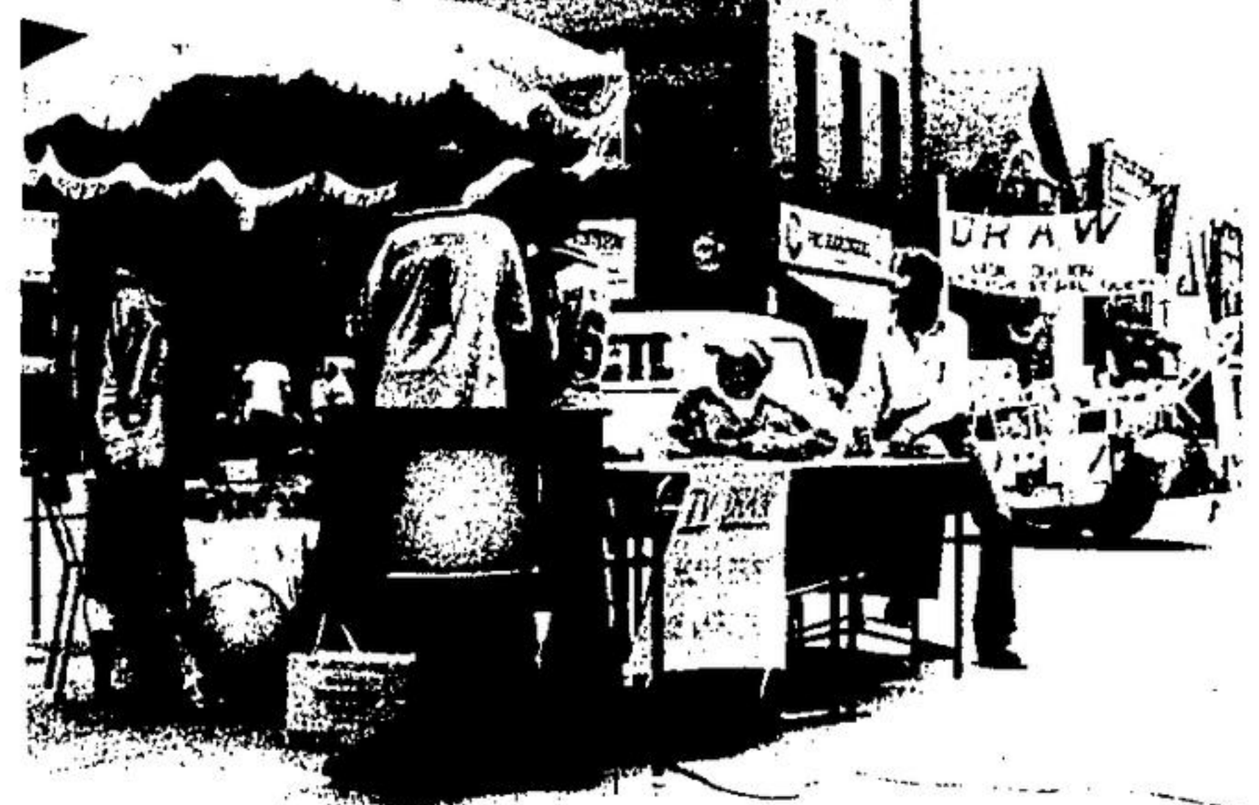
MINOR LACROSSE HAD A BOOTH in Back to Acton Days activities as they raffled off a color television to raise money for their cause. Draw for the TV will be held at the Acton Fall Fair.

For pace fans, the track will be running a pace version of the same race, Saturday. Canadian foaled three years olds will be running for the prize money, again set at $25,000.