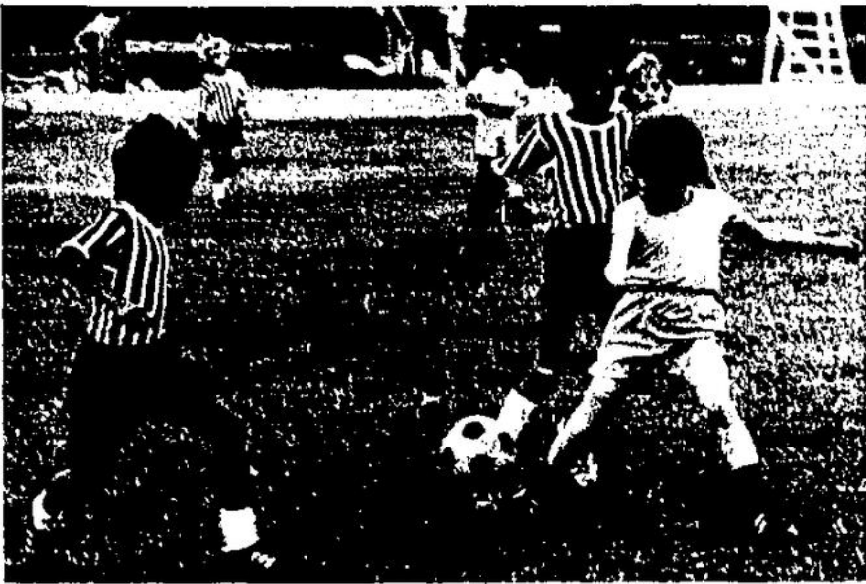
ACTON ROCKETS, in the black and white shirts, defeated a tenacious Rockwood atom squad 3-0 Monday in minor soccer play. Acton is having a successful season on the pitches.