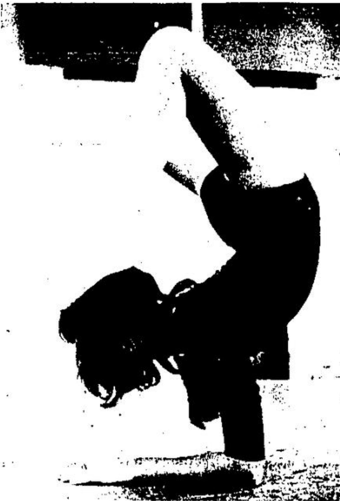
JILL MORRIS' acrobatics were a hit of the show.