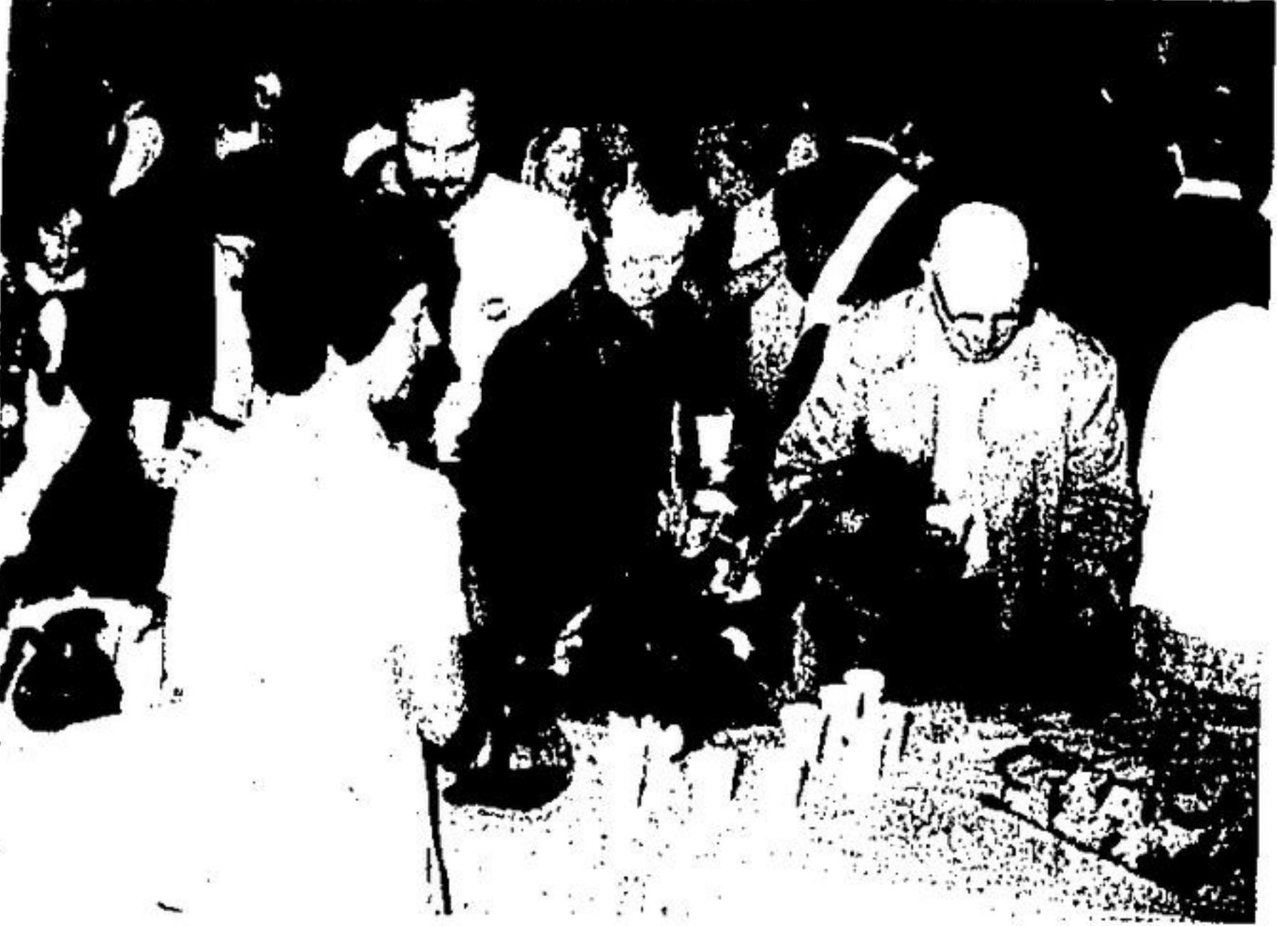
FRUIT BREAD, coffee and tea were served to the guests who were asked to come in and tour Rockmosa Centre. People were surprised at the size of the hall once inside.