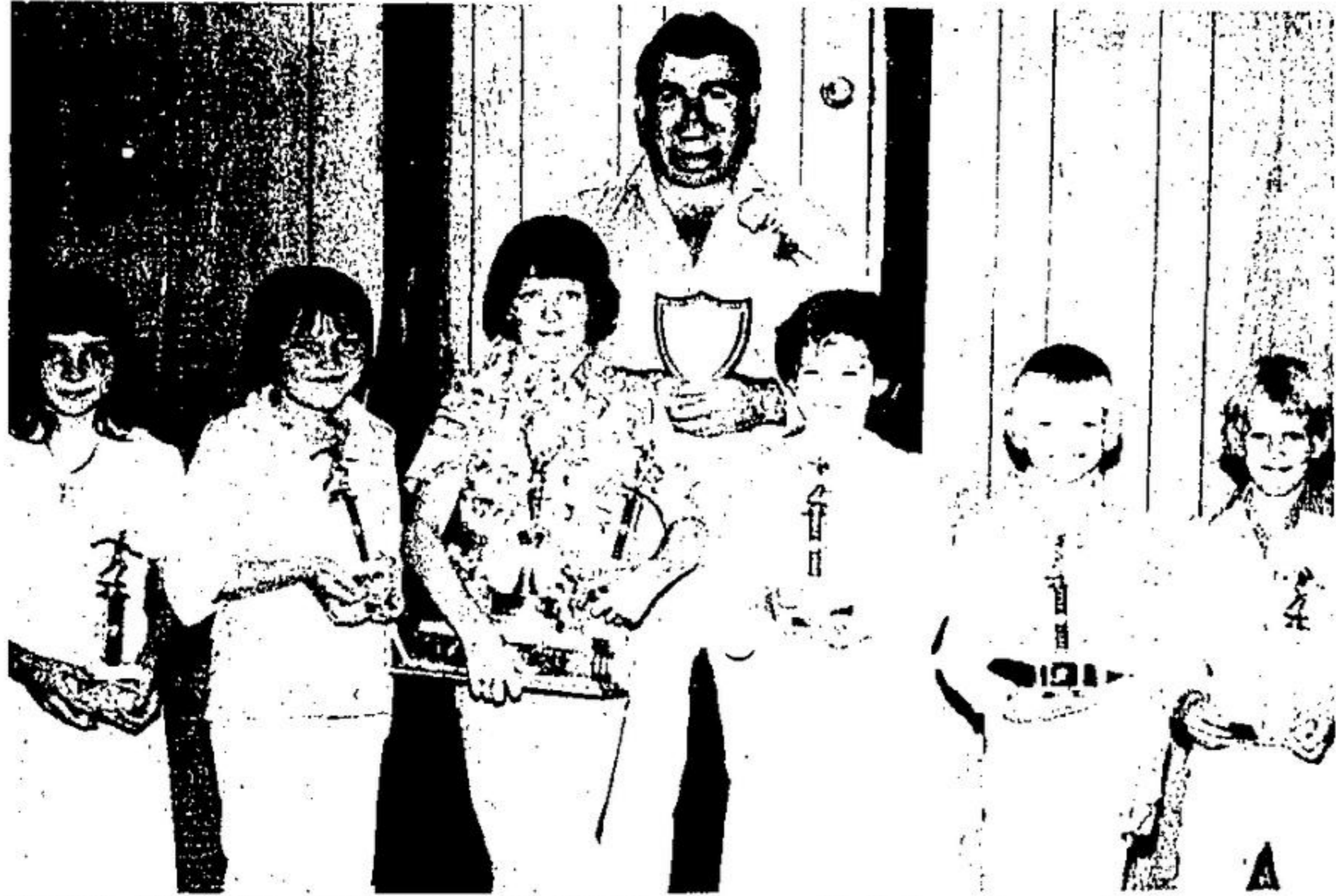
YOUTH BOWLING Council Bantam playoff winners, the Falcons, proudly display the hardware they received at the league's annual bowling banquet Saturday evening. Left to right,