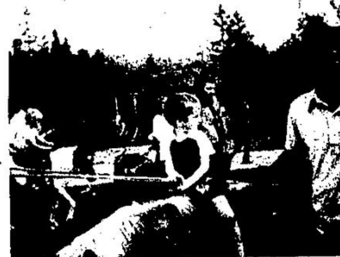
PONY RIDES for the children were a big attraction with many fathers taking a stroll alongside!