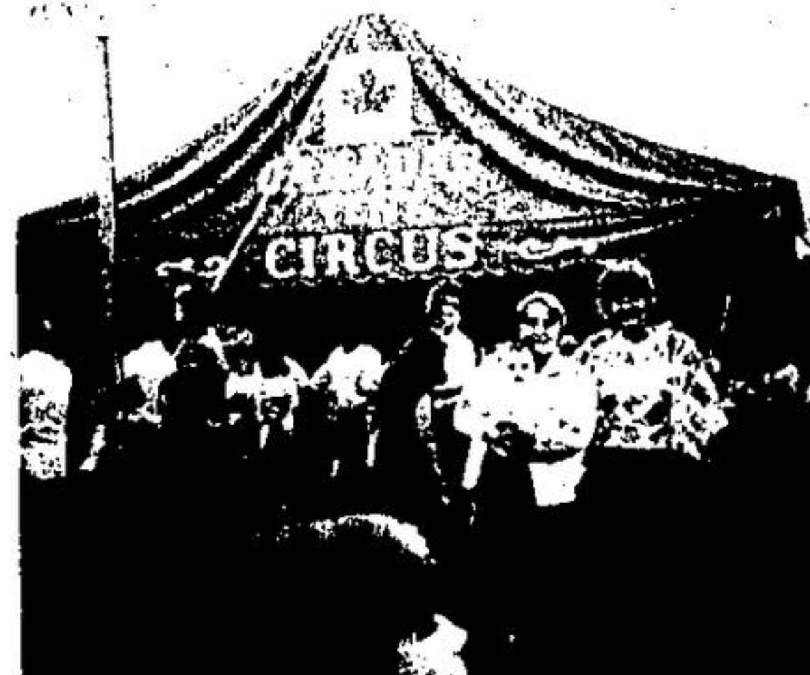
AREA PEOPLE gather outside the Martin and Downs Circus tent for the 8 p.m. performance last week. Crowds came early to enjoy the pony rides, snake exhibit and concession stand.