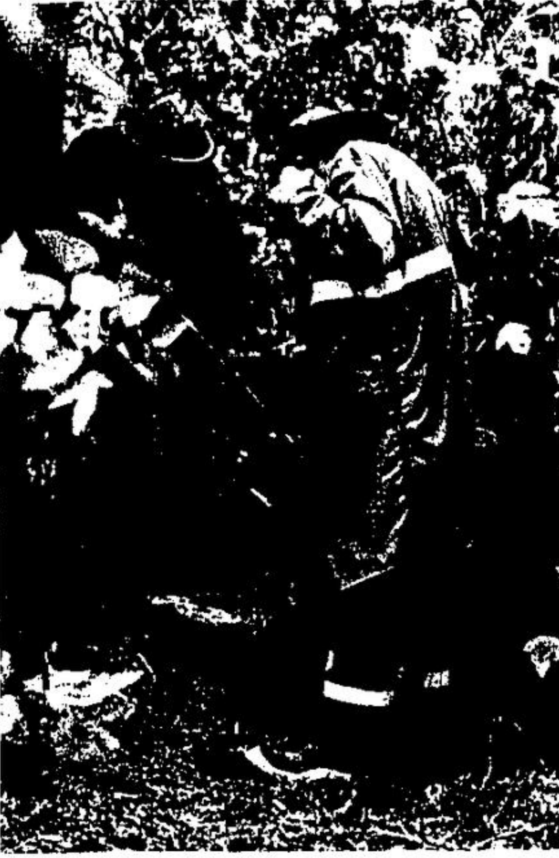
FIREFIGHTERS DOUSE a bush fire Monday before it has a chance to spread. Fire was in the woods near Poplar Ave.