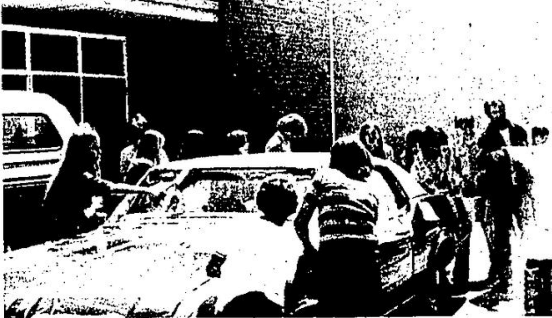
GRADE SEVEN and eight students at M.Z. Bennett school held a car wash Saturday at the school to raise money. Willing hands cover a customer's car with suds.

Scouts should be at the Joseph Gibbons public school, in Moore Park, in Georgetown in their activity uniforms.