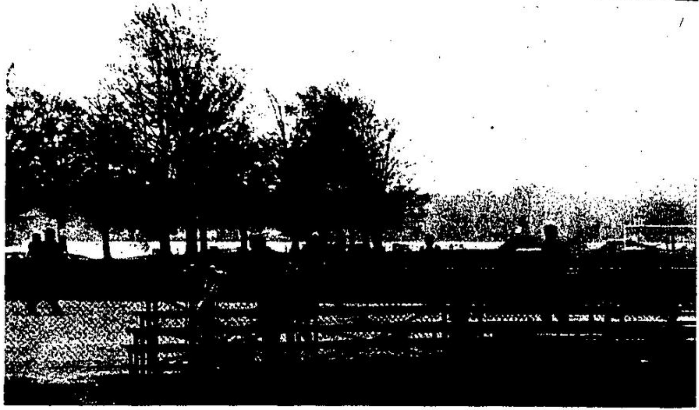
INDUSTRIAL SOFTBALL emulated the Blue Jays by opening their season in the worst weather they could find. Hail forced the cancellation of the final game of the day, which will be played this Thursday evening at the park when J & T Sports meet Family Cleaners.