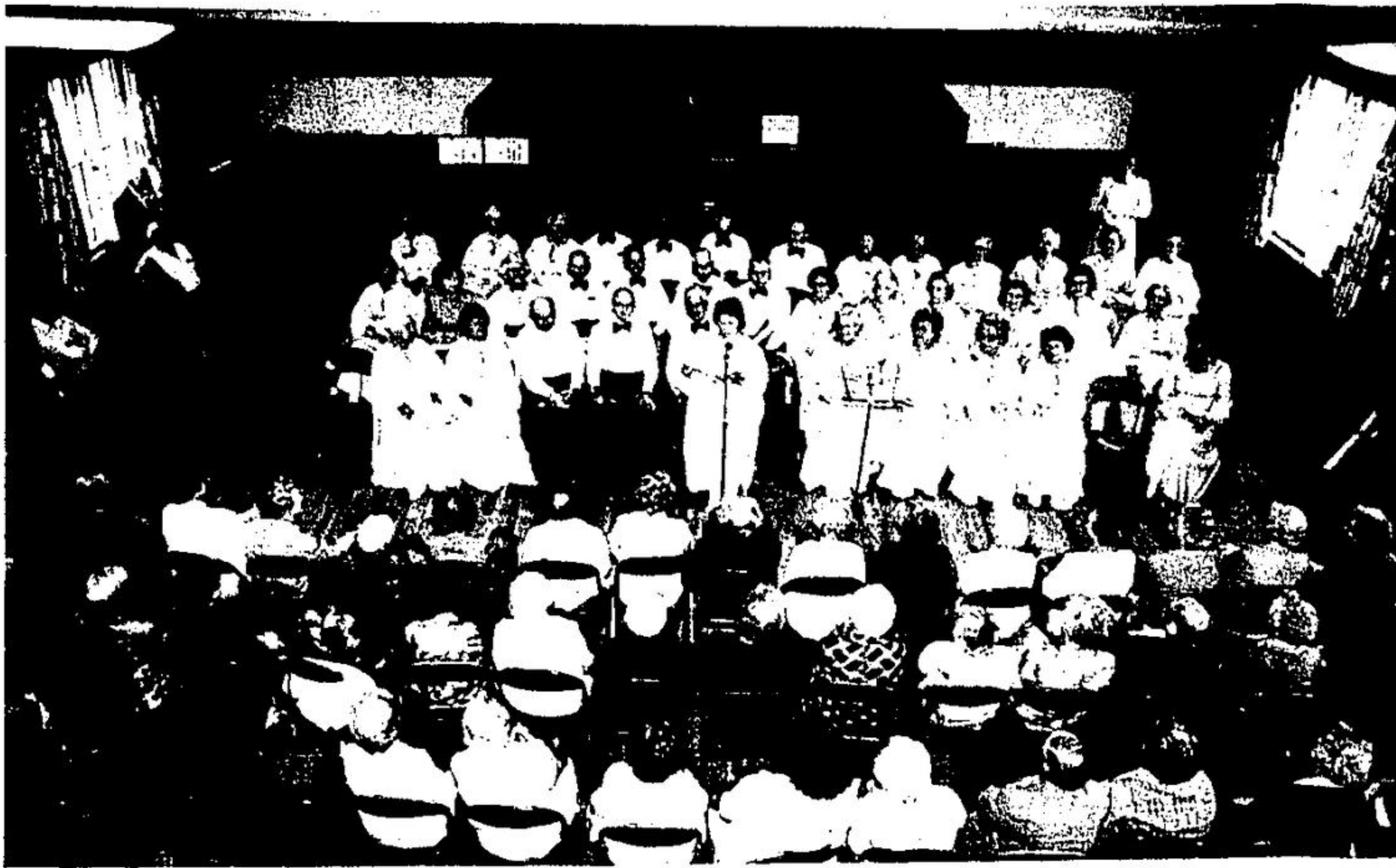
BIRD'S EYE view of Burlington choir entertaining in the parish hall was taken from the upstairs window. The 38-voice choir presented a delightful program for the members of Acton Golden Age Club and their guests at their last meeting.