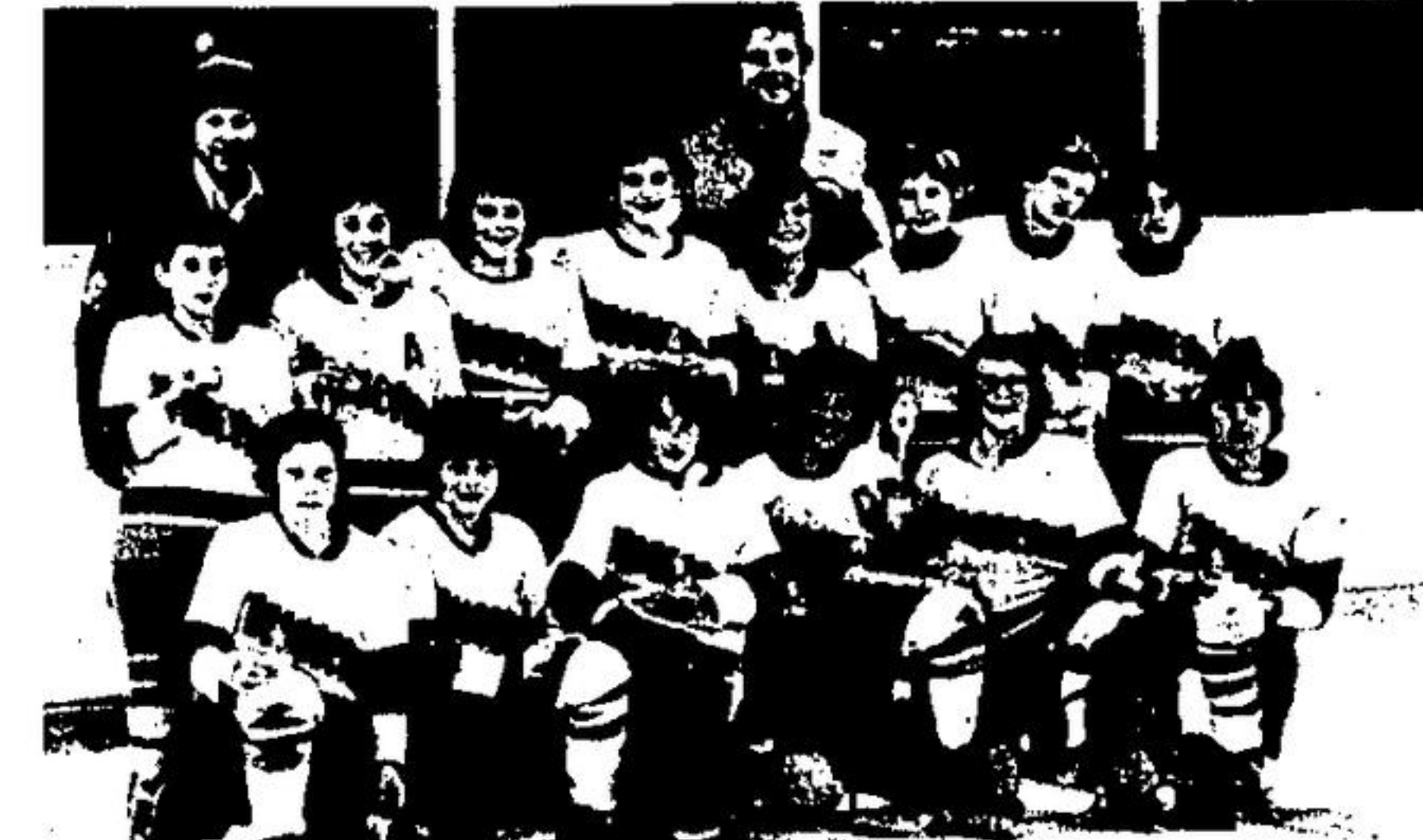
ORANGEVILLE TOOK the consolation trophy in the Acton Centennial Atom Tournament this year, beating Bay Ridges 5-2 in the final.