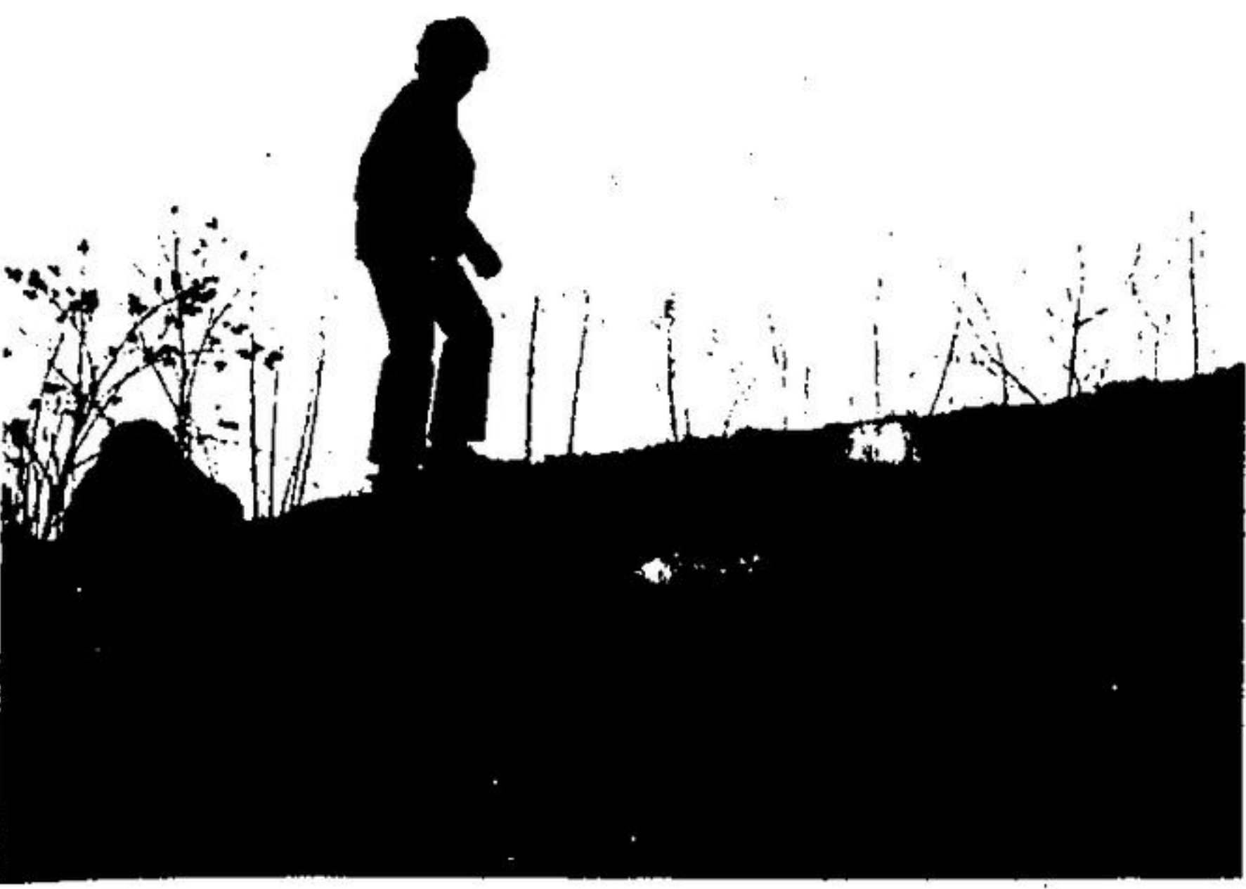
JIM FINCH EXAMINES still smoking remains of Sunday's grass fire on Churchill St.