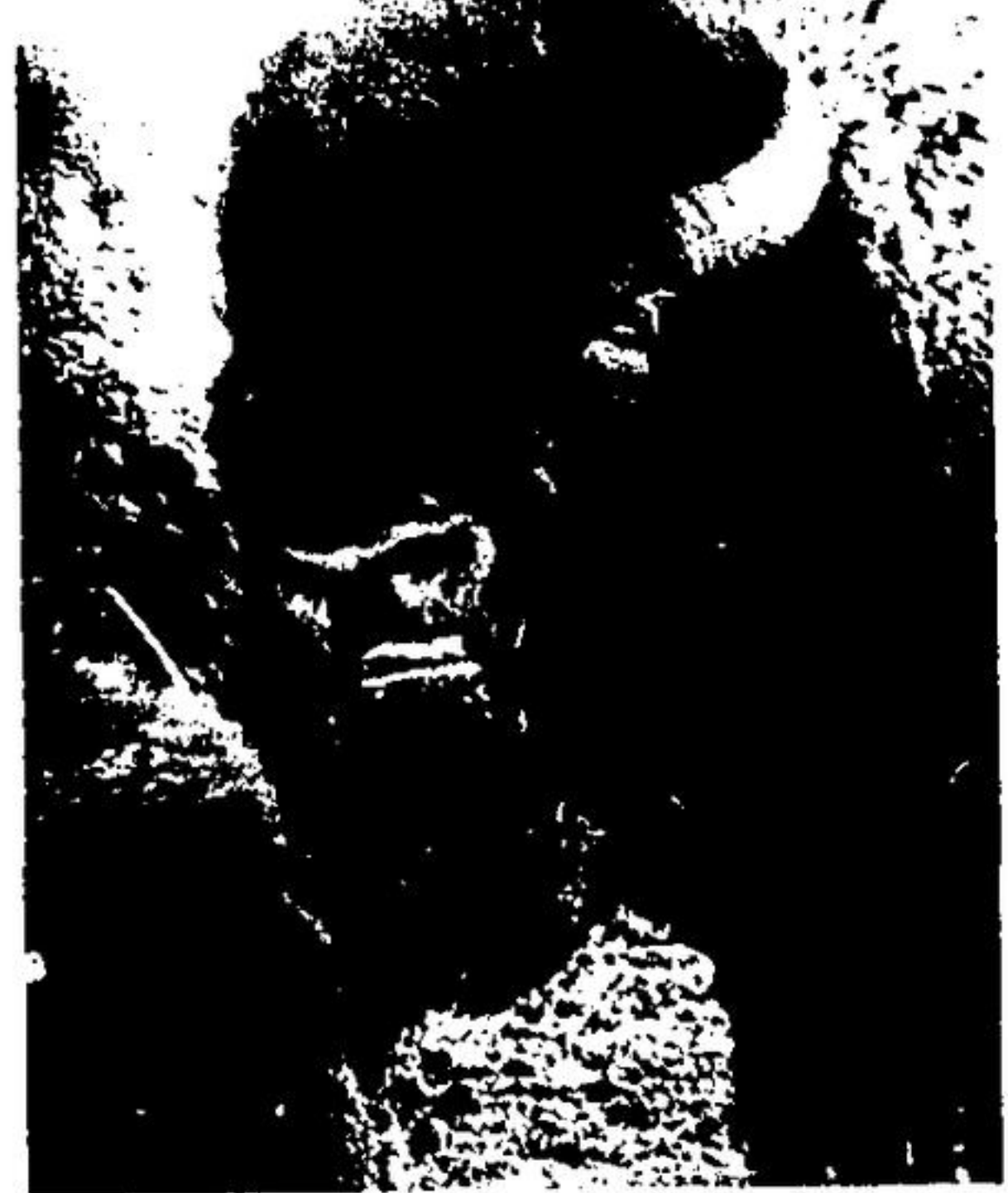
GET OUT of my park! bellows this enormous buffalo of Rockton's Lion Safari. Many area children were taken to the zoo during the school winter break.