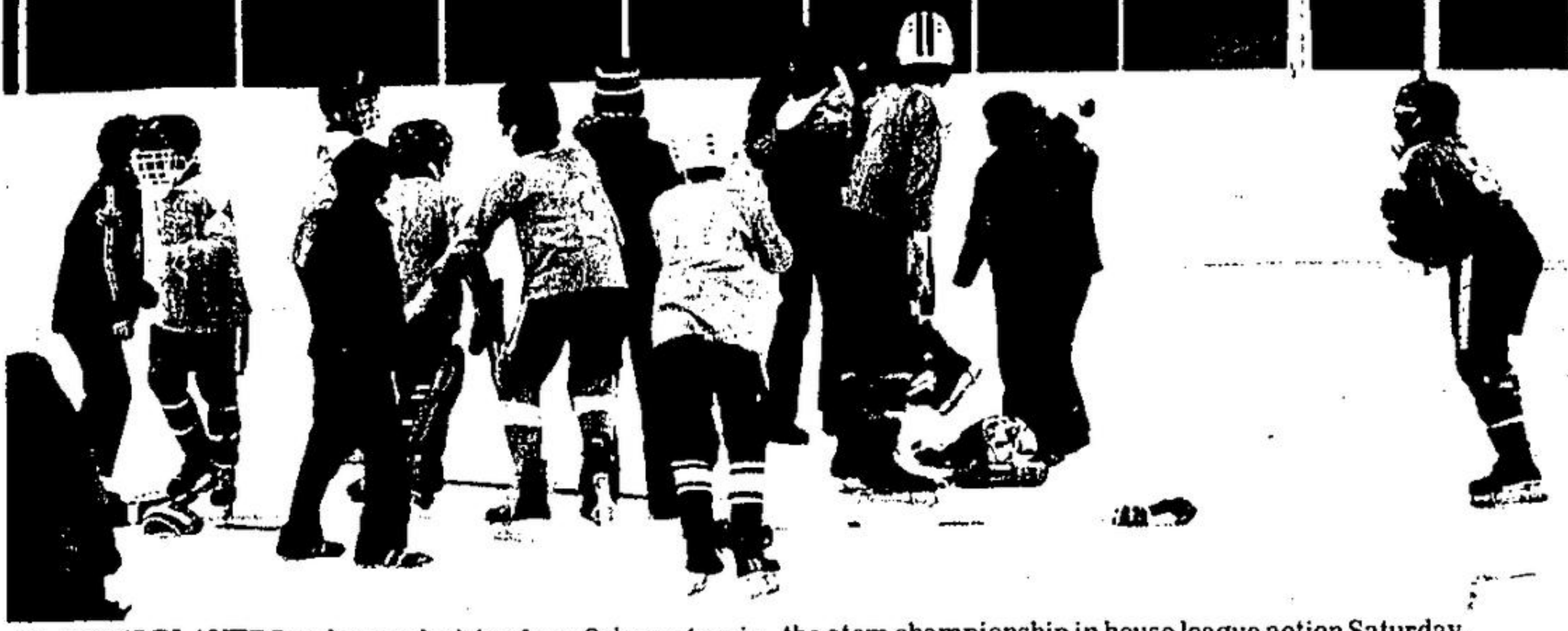
ST. KITTS PLAYERS took a 6-2 decision from Oshawa to win the atom championship in house league action Saturday.