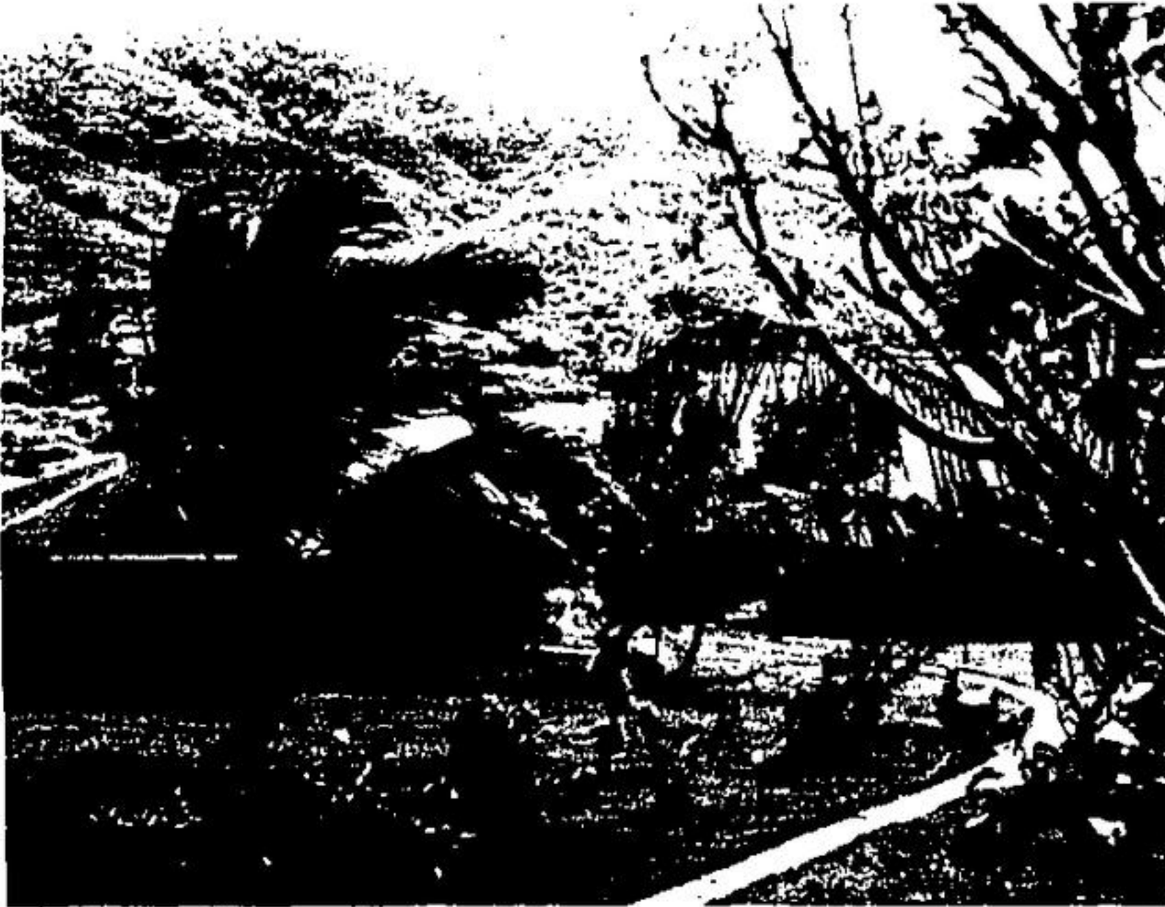
A QUIET resort nestles among the palm trees and mountains on the island of Monserrat. The island is a winter home to many Canadians.