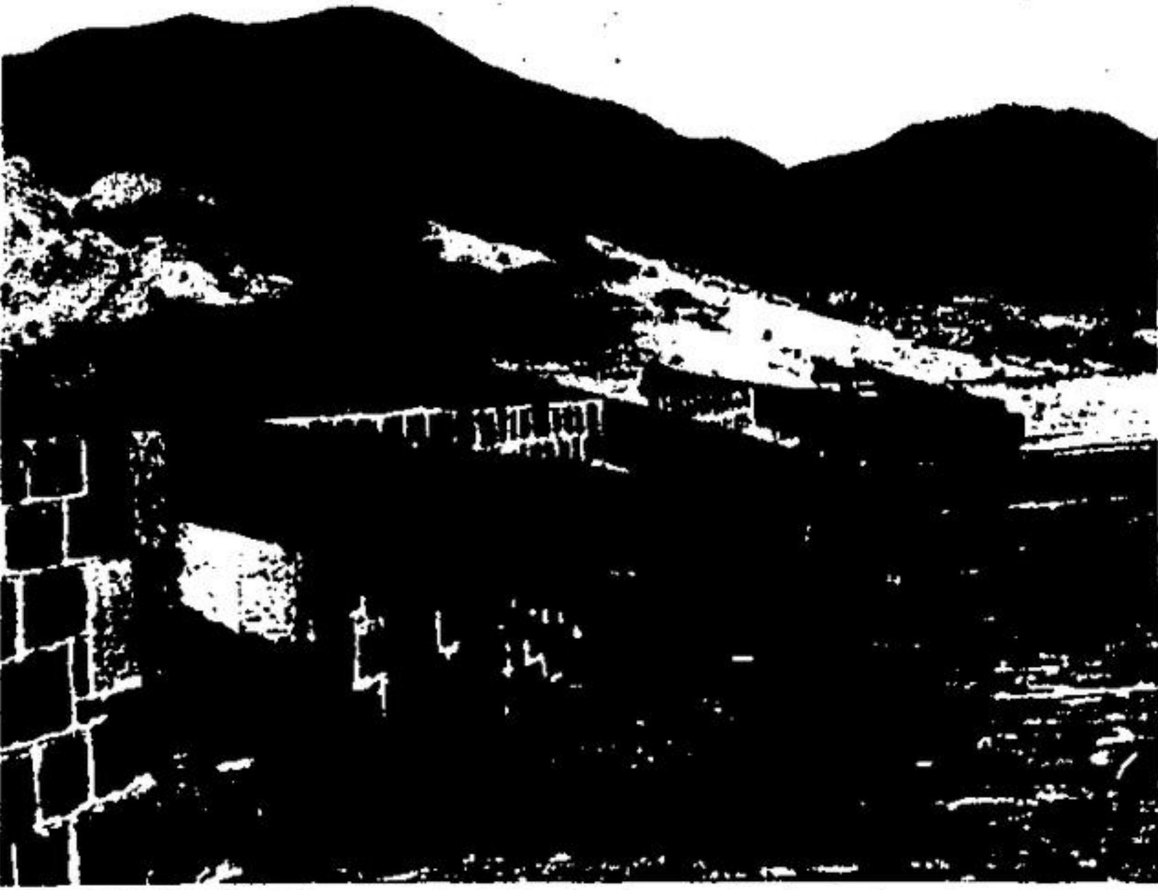
THE CANNON still peer out of the battlements of an abandoned English fortress on Antigua. The island was captured by the French in 1666 but soon reconquered by the British. Bill Stuckey photographed the fortress during his winter holiday.