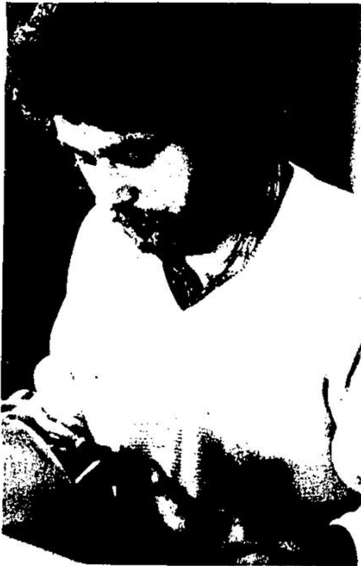
Sheridan student getting experience