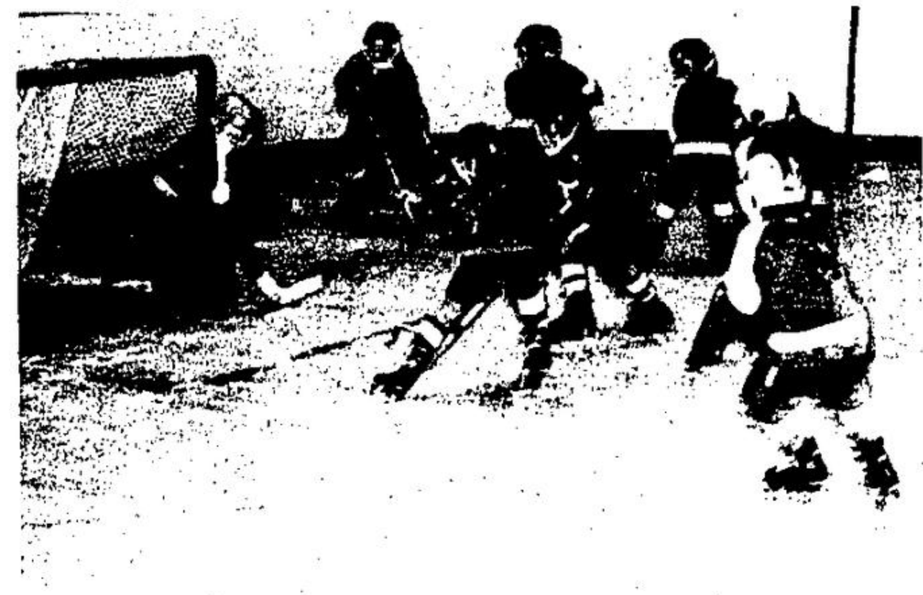
MINOR ATOMS SWARM around Orangeville's net late in Saturday's playoff game here. Orangeville won in overtime to tie up the series at two games each. Acton went to Orangeville Monday to take the series.