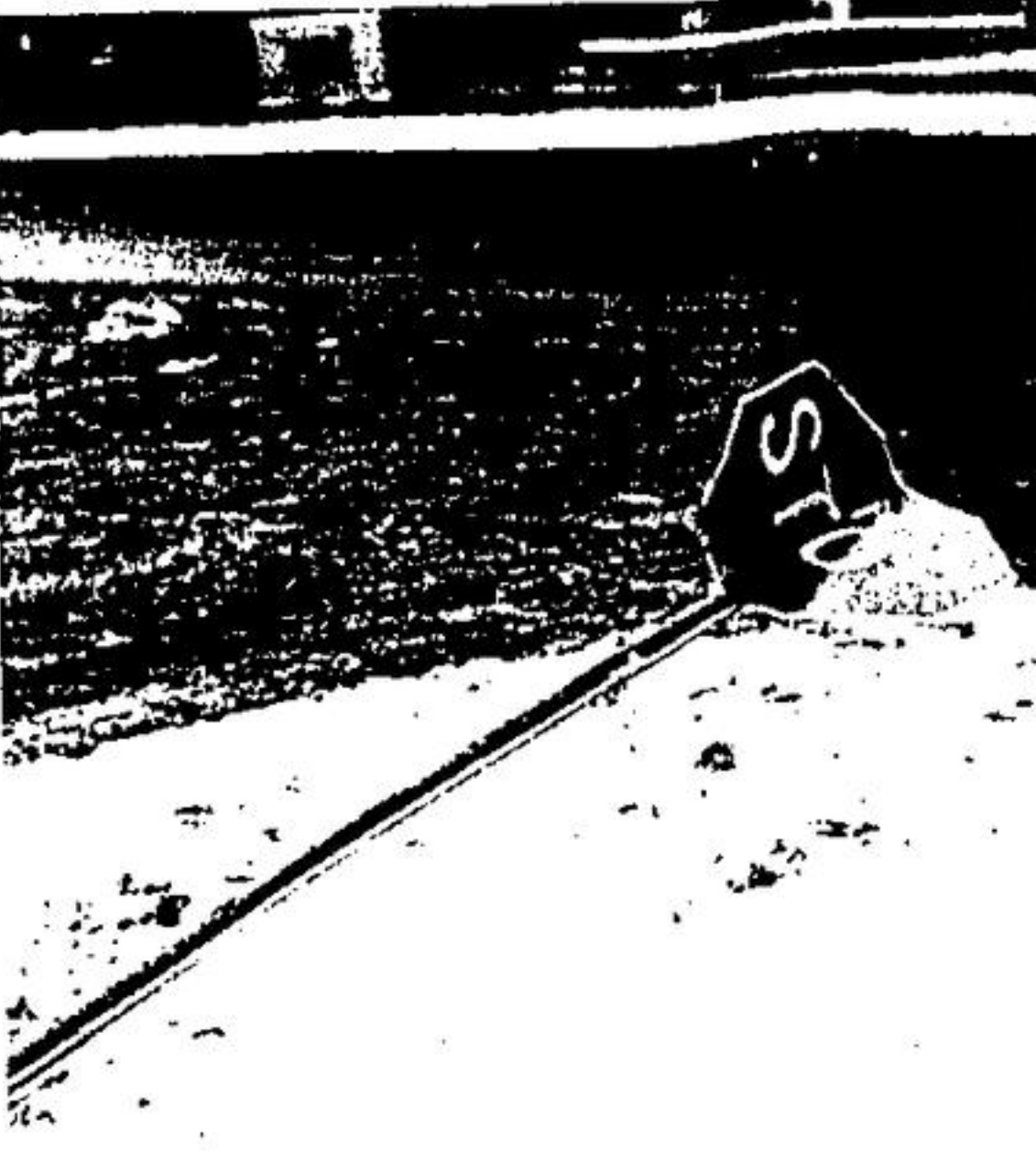
SOMEBODY DIDN'T. The fallen stop sign is at the corner of John and Mill.

Registration is January 12 at the high school. Classes started the week of January 17.