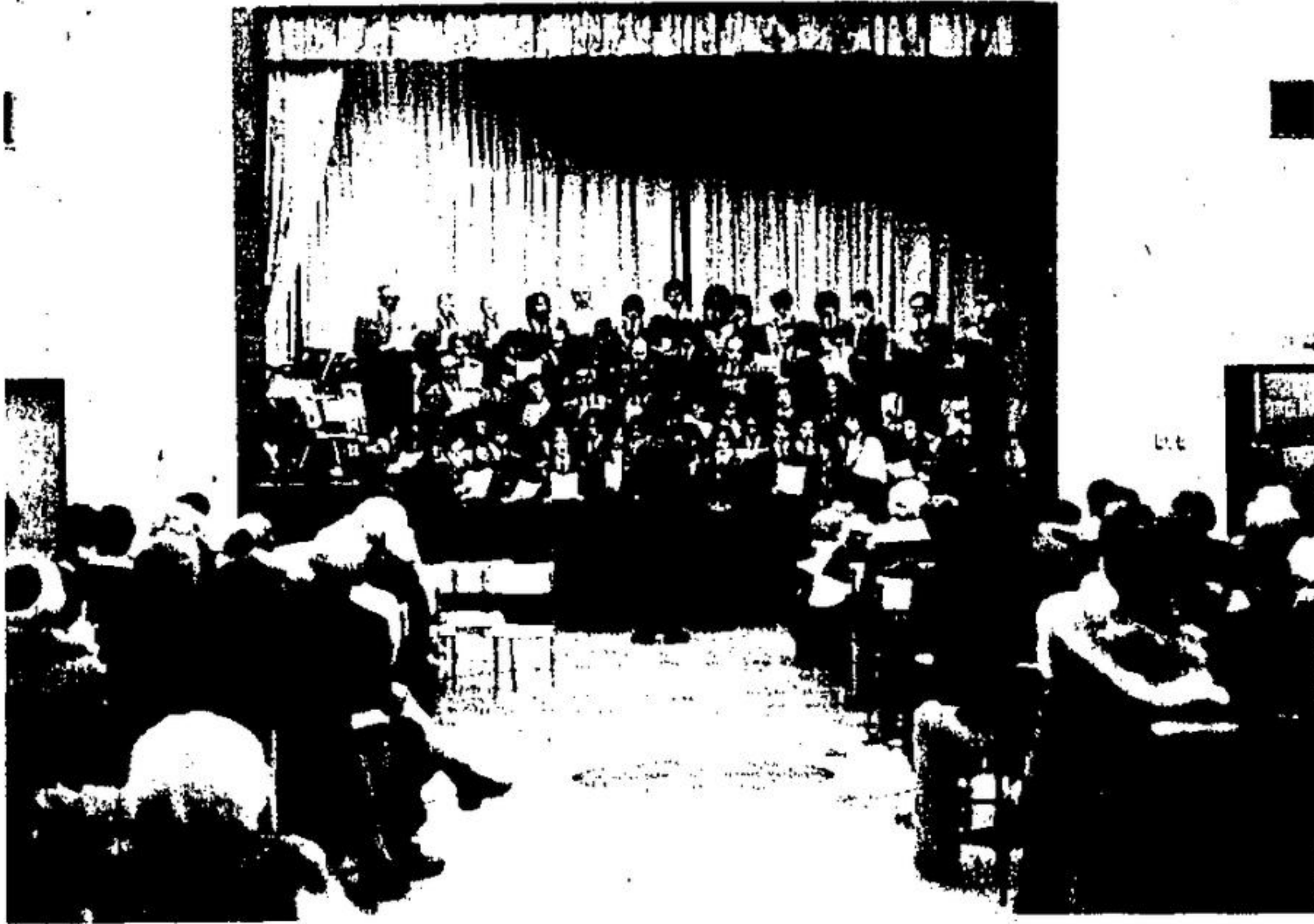
The band sings in chorus