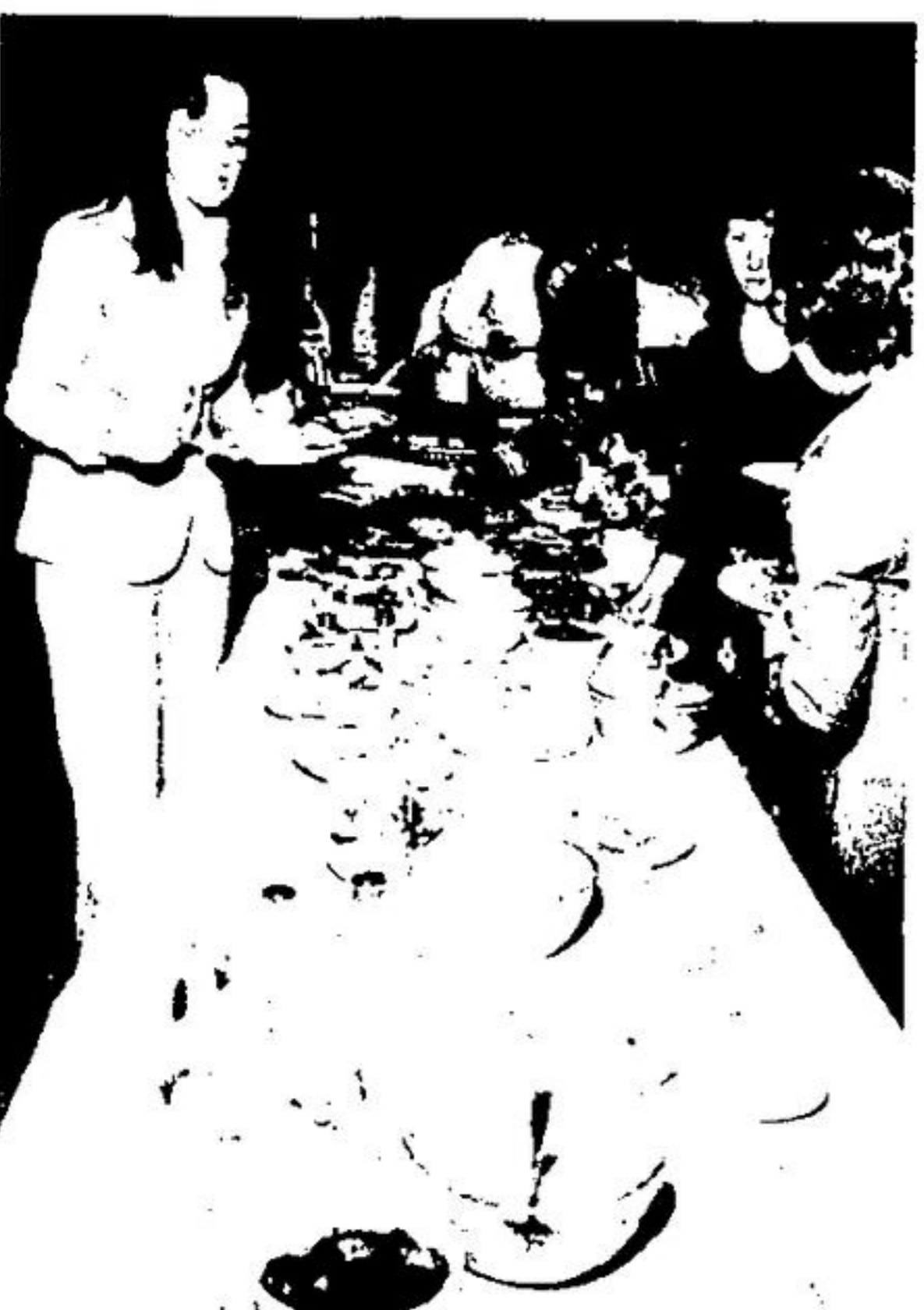
BOUNTIFUL BUFFET attracted the 150 people who attended the family party arranged by Acton firefighters Sunday.