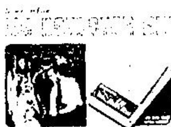
C 15 95