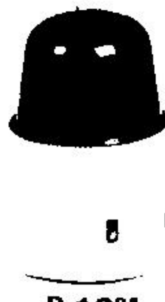
D 12 95