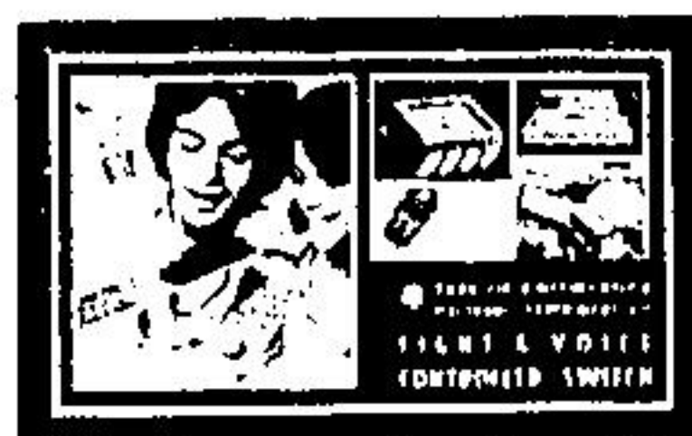
F 7 95