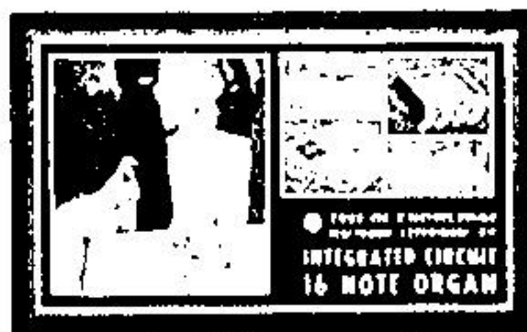
E 7 95