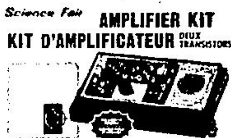
G 9 95