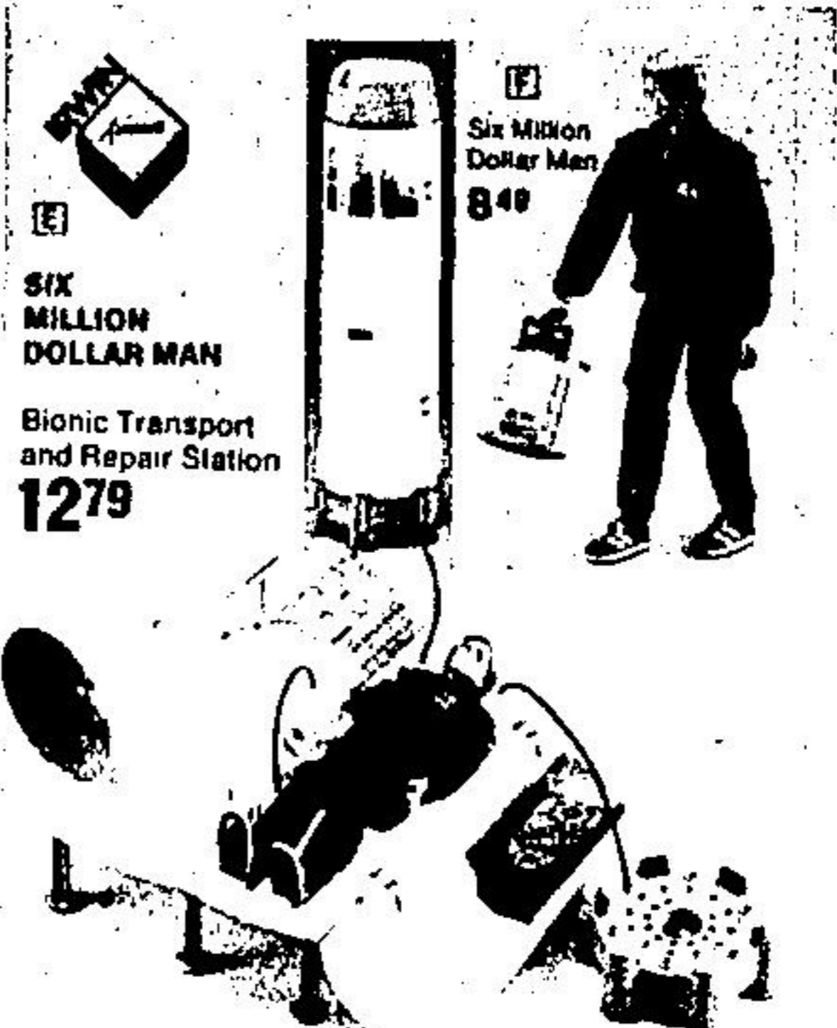
SIX MILLION DOLLAR MAN Bionic Transport and Repair Station 1279