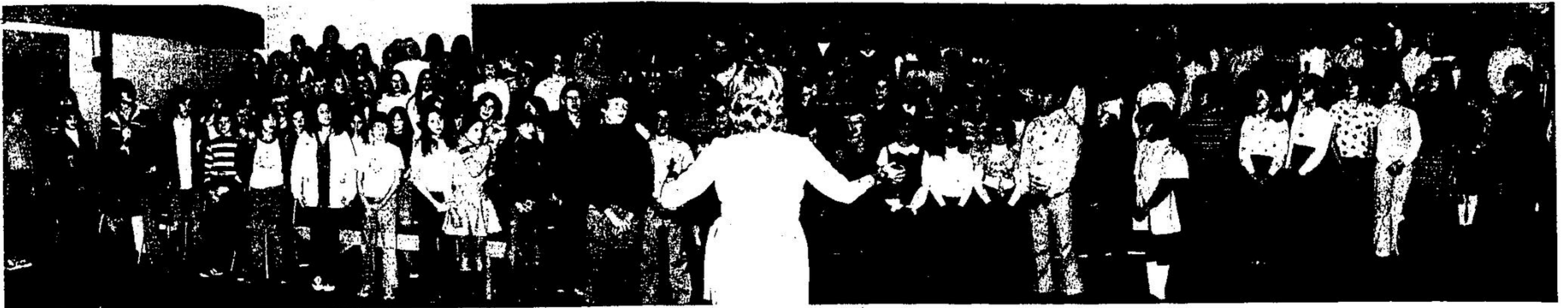
Massed musicians from Robert Little, M.Z. Bennett and Brookville present Music '76 concert with high school band Sunday