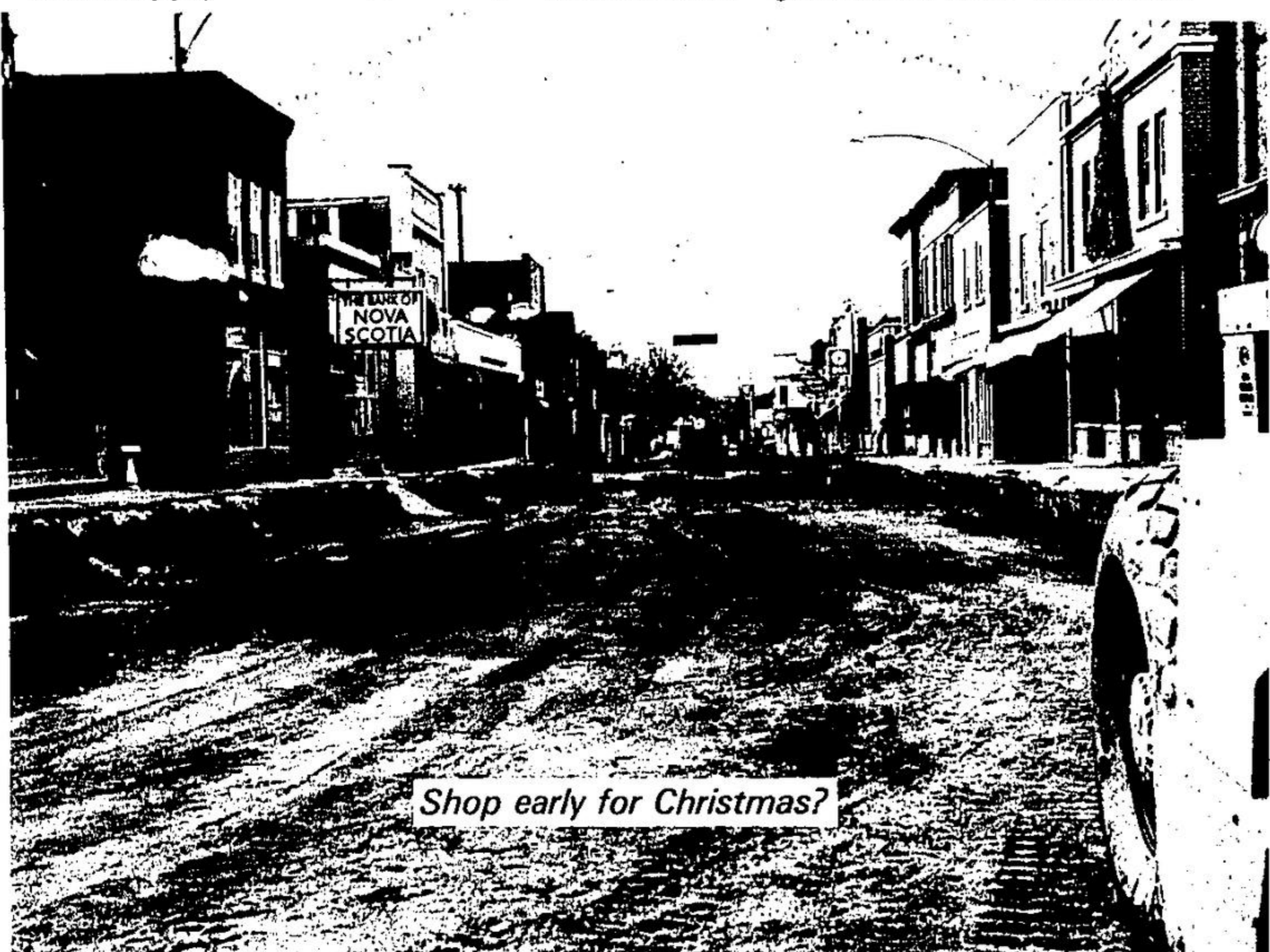
Shop early for Christmas?

"It would be much easier to (Continued on page 3)