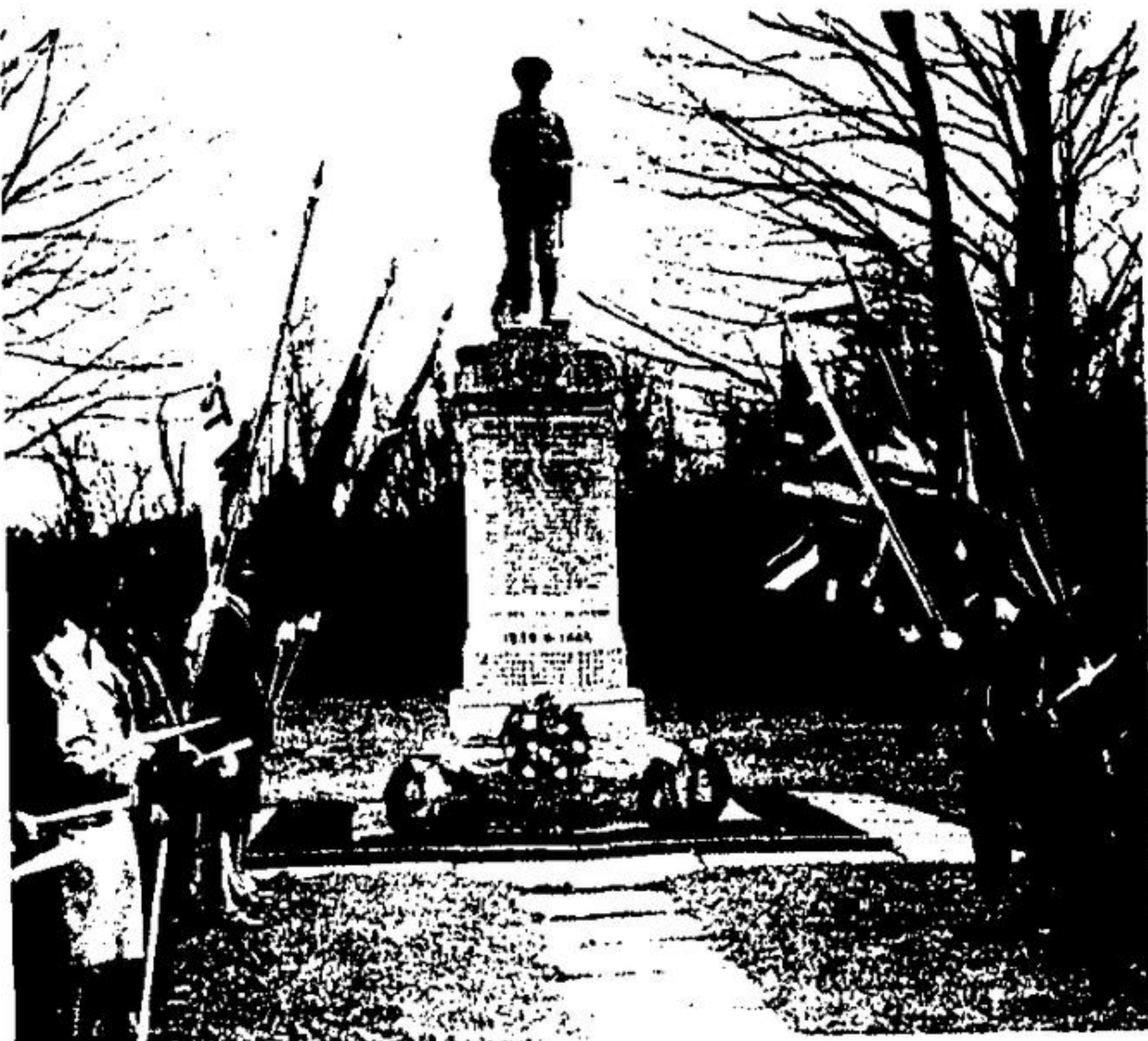
REPRESENTATIVES OF the town of Milton and the Acton and District Legion were at the Soldiers' Memorial, Nassagaweya, for a joint Remembrance Day service on Sunday afternoon.