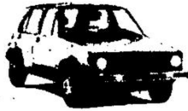
VW Rabbit Both Greatly Reduced

Phone us to-day for credit approval. ON THE SPOT BANK FINANCING