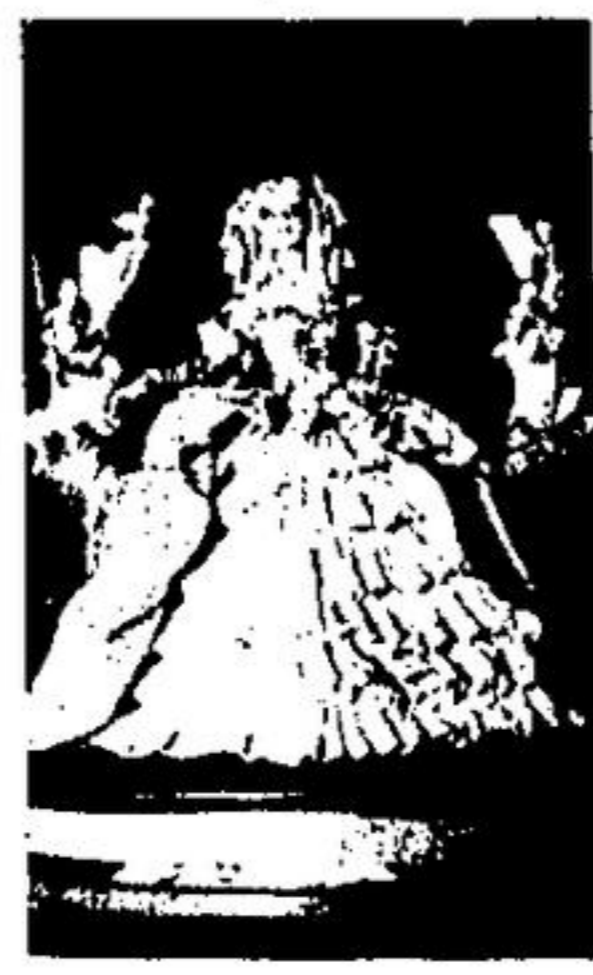
CERAMIC figure was fashioned by Del Howse of the Acton Arts and Crafts group.

Articles lovingly created by the women included hand weaving, leather, hooking, batik, wood burning, oil and water colours, knitting, crochet, porcelain and ceramics, decoupage, enamelling and basketry.